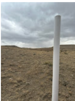
PIT PHOTOS.jpg 124K