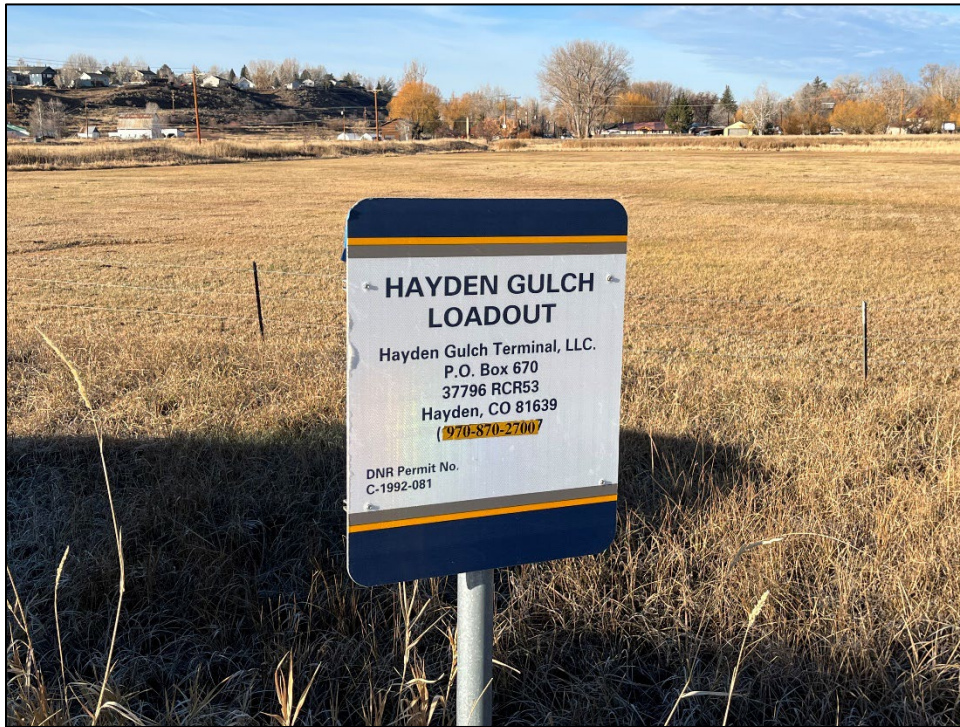
Photo 1: Mine sign located at the intersection of Highway 40 and Hawthorne St.