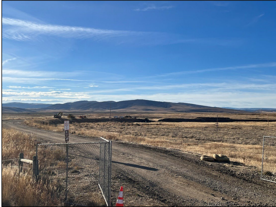
Photo 5: Culverts were being replaced in the previously Phase III bond released Tracks to Trails rail loop area.