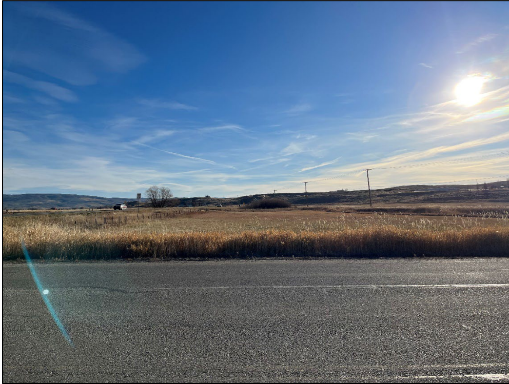
Photo 3: Revegetated hayfields at the northern edge of the permit boundary.