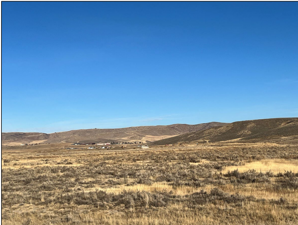
Photo 6: View north of area where culverts are being replaced by the City of Hayden.

Number of Partial Inspection this Fiscal Year: 3