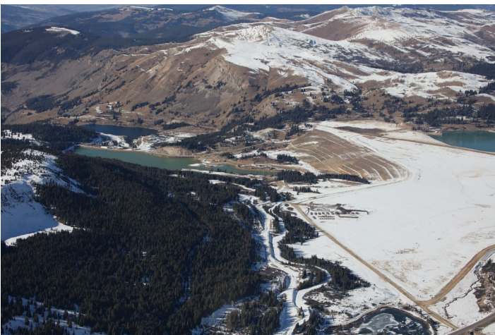
1 Dam - Robinson Lake

The McNulty and North 40 OSF's were observed. No abnormal conditions were noted. OSF's appear to be functioning within the established design criteria.