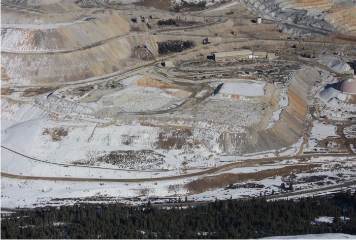
North 40 OSF

No problems or violations were noted during this inspection.