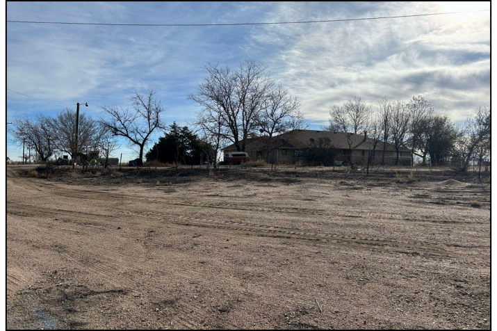
Photo 2 – Photo of existing vacant residence in north center of proposed permit area.