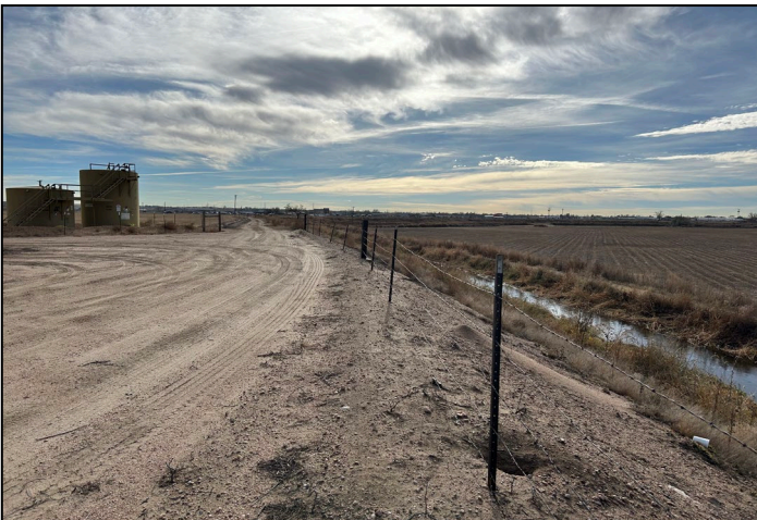
Photo 3 – Photo of some existing gas and oil structures and irrigation ditch located south of structures near north center of proposed permit.