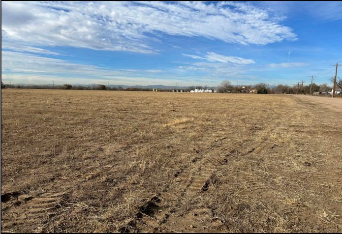
Photo 1 – Photo of existing cropland taken looking west from site access point near Hwy 85.