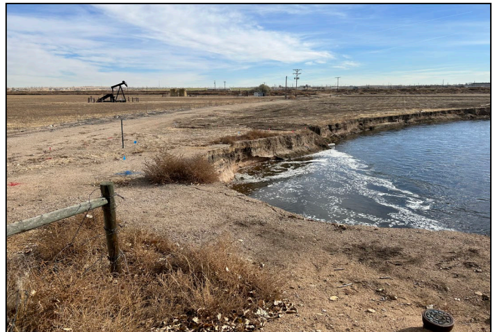
Photo 4 – Area of existing active bank scouring on north bank of Platte River near south center of proposed permit.