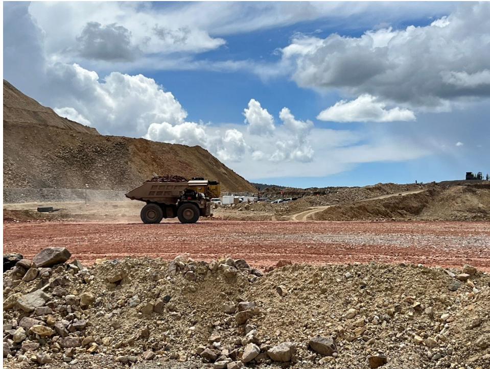
Photo 13 – Owner Placed Structural Fill Compaction (June 16, 2023)