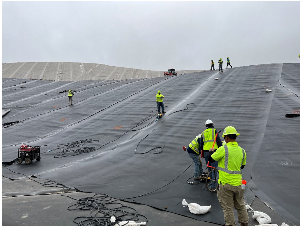
Photo 17 – Double Fusion Weld Seaming of Geomembrane (June 30, 2023)