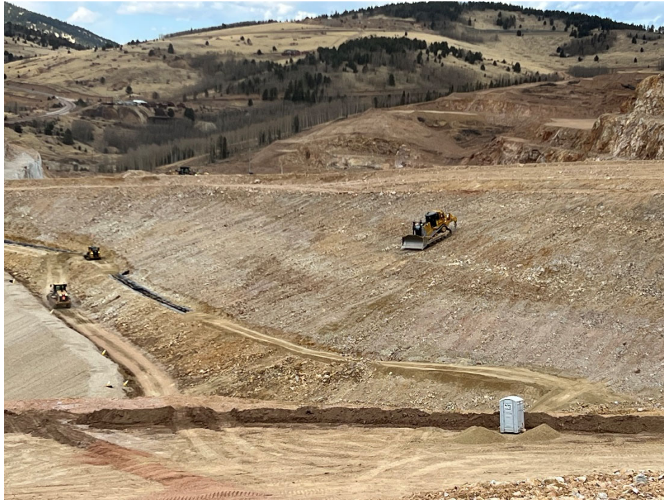
Photo 5 – Leak Detection Trench 1 Construction and Subgrade Preparation (May 3, 2023)