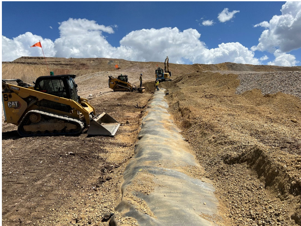
Photo 4 – Phase 2 Anchor Trench Geomembrane Exposure (May 3, 2023)