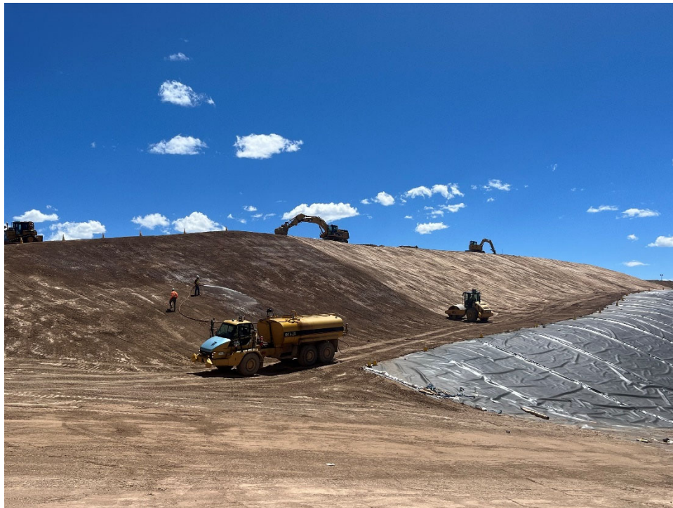
Photo 20 – Moisture Conditioning of SLF; Compaction of SLF with Tether System (July 11, 2023)