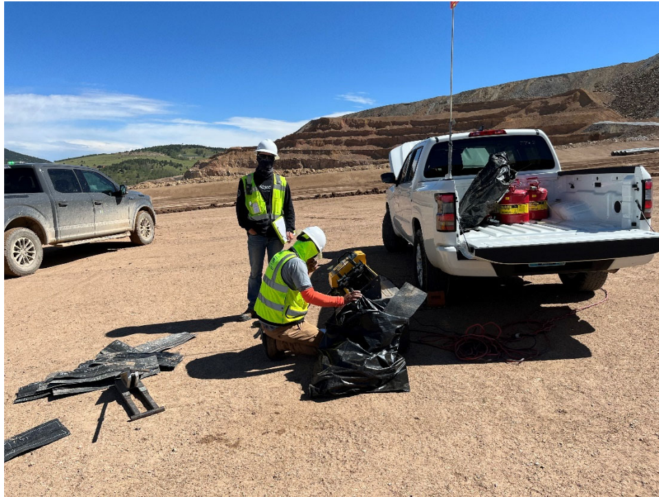
Photo 19 – Testing of Geomembrane Destructive Samples (July 11, 2023)