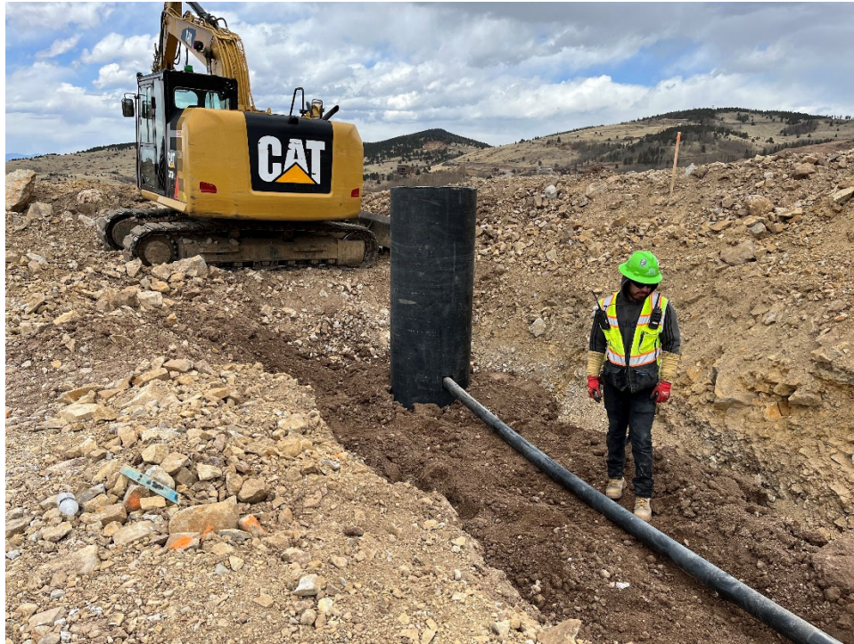
Photo 7 – Leak Detection Trench 1 Manhole Construction (May 5, 2023)