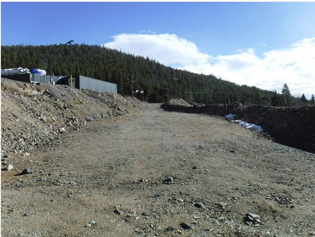
Photo 4: Service road leading down from the main office area to Pond 1