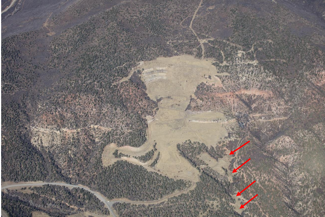
East mine with Ponds 1 – 4 indicated with arrows