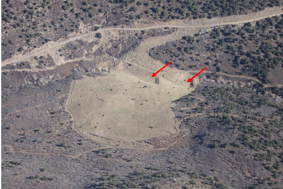
West Mine with ponds indicated with arrows

Number of Partial Inspection this Fiscal Year: 4