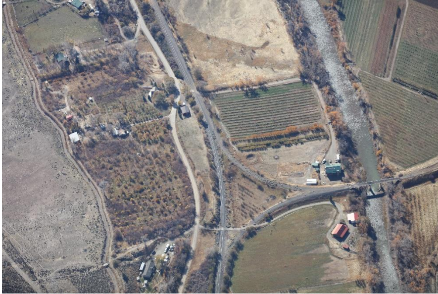
“Y” northeast of loadout