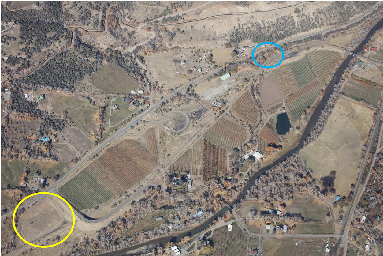
Loadout with pond (blue circle) and coal storage by highway (yellow circle)

No enforcement actions were initiated as a result of this inspection, nor are any pending.