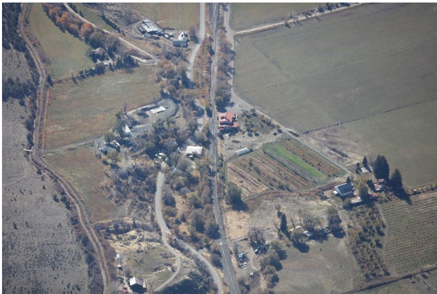
Tracks south of “Y”

Number of Partial Inspection this Fiscal Year: 4