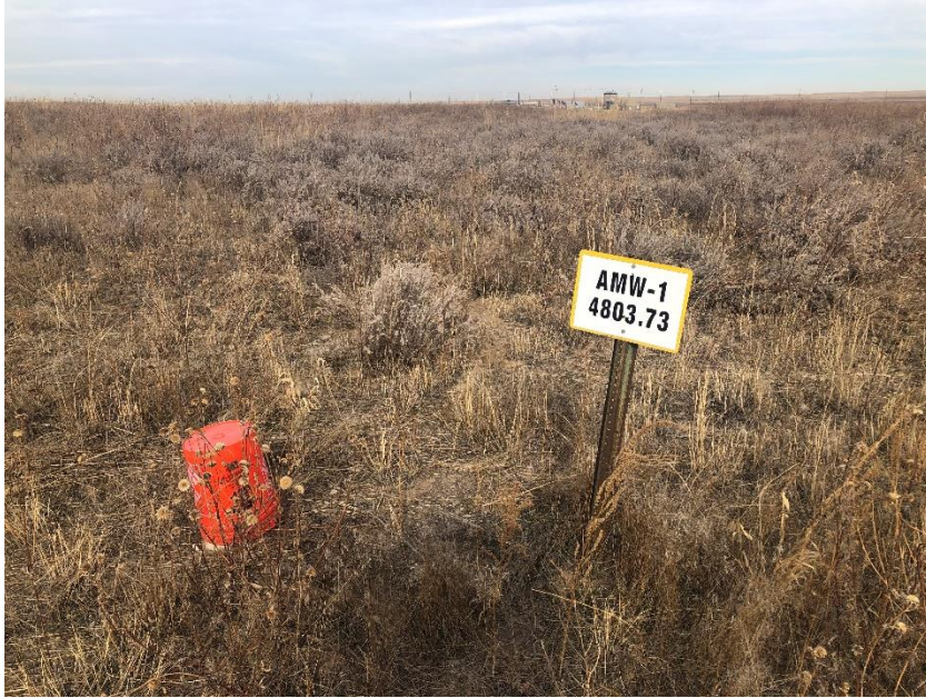
Monitoring well in Area 43