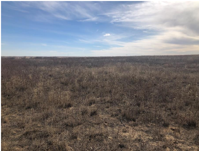
Looking southeast from the northwest corner of Area 43 (northwest corner of all of disturbance in the permit)

Number of Partial Inspection this Fiscal Year: 3