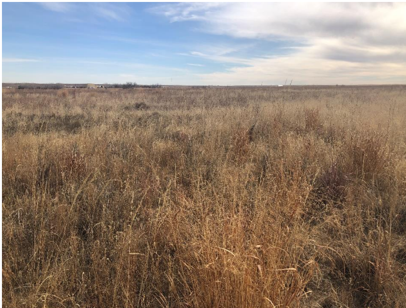
Good vegetation in northeast portion of Area 43 (Area 37 in background)

Number of Partial Inspection this Fiscal Year: 3