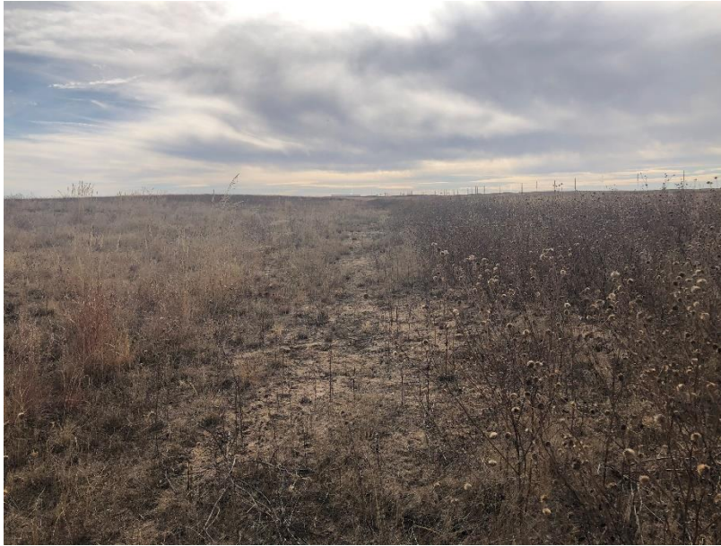
West side of site, looking south, with Area 44 on the left and undisturbed area on the right