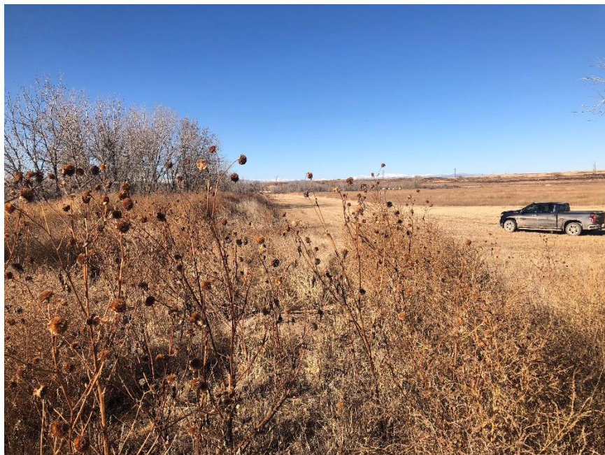
Levee on south side of site