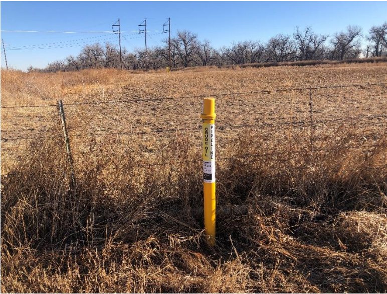
Oil line marker near NE entrance