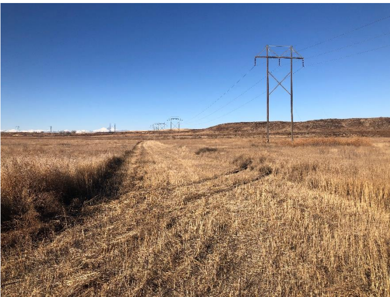
Public Service power line on north side of site