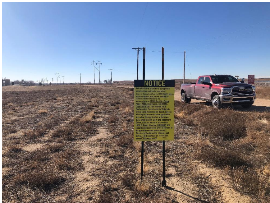
Notice at WCR46