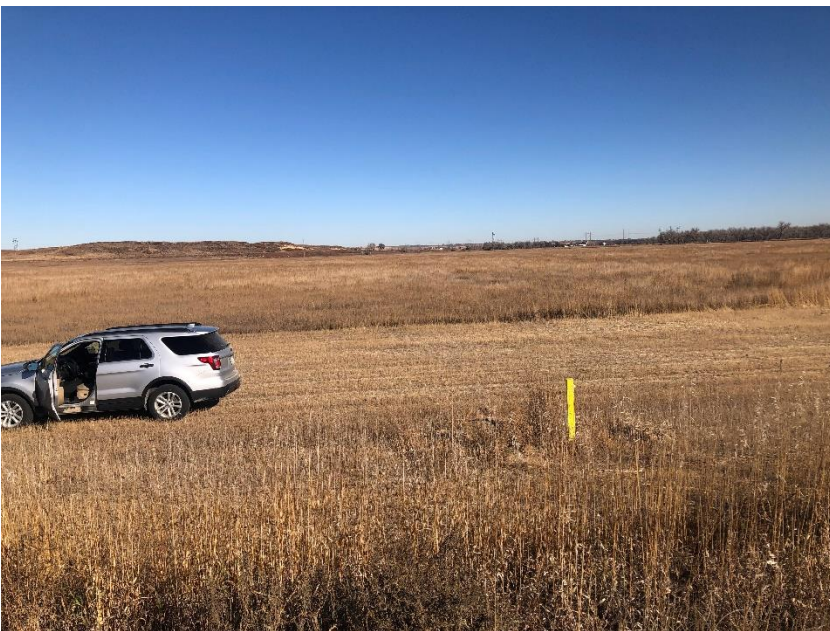
Looking north at site from levee on south side of site