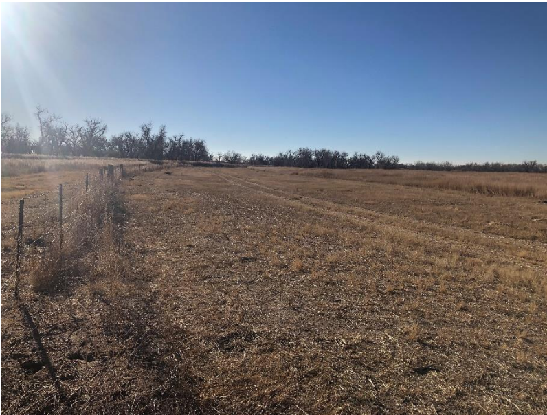
Looking at east side of site toward river, from NE entrance