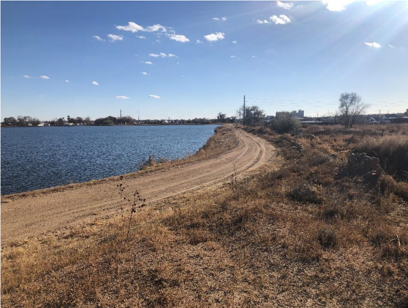
West side of site, looking south