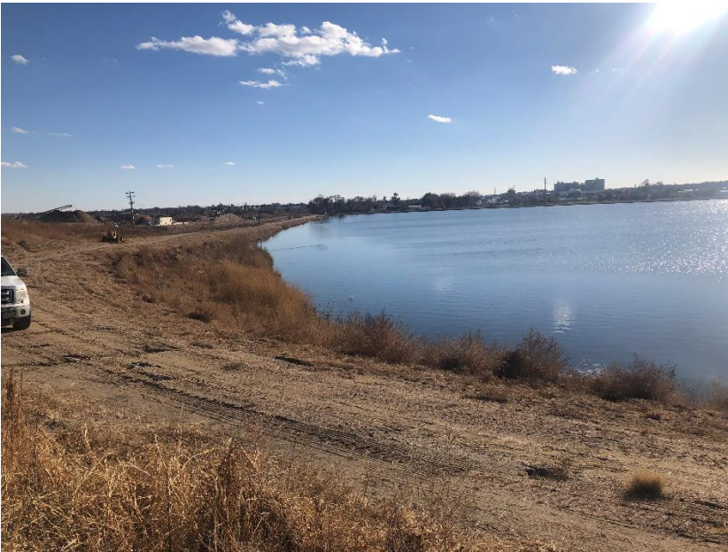
East side of site, looking south