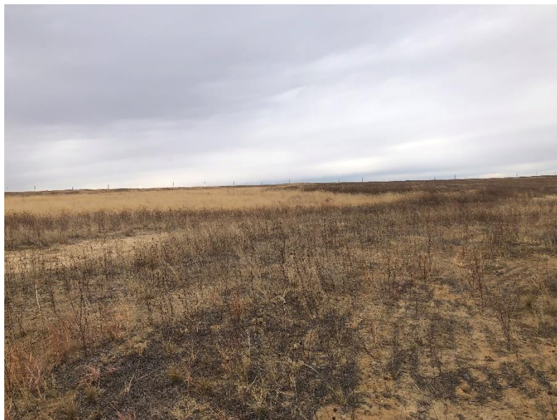
Areas 33 and 36, looking west at east end