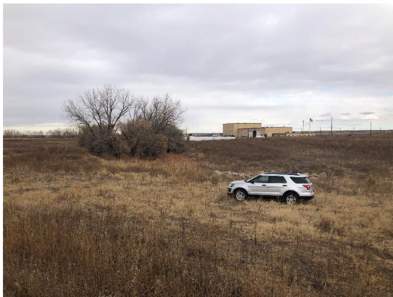
Dugout Pond and reclaimed topsand storage, south of the facility area

Number of Partial Inspection this Fiscal Year: 2