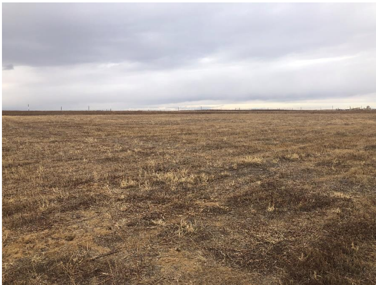
Area 36, which has been harrowed before seeding

Number of Partial Inspection this Fiscal Year: 2