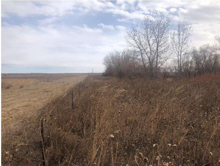
Area downstream of Sediment Pond #2