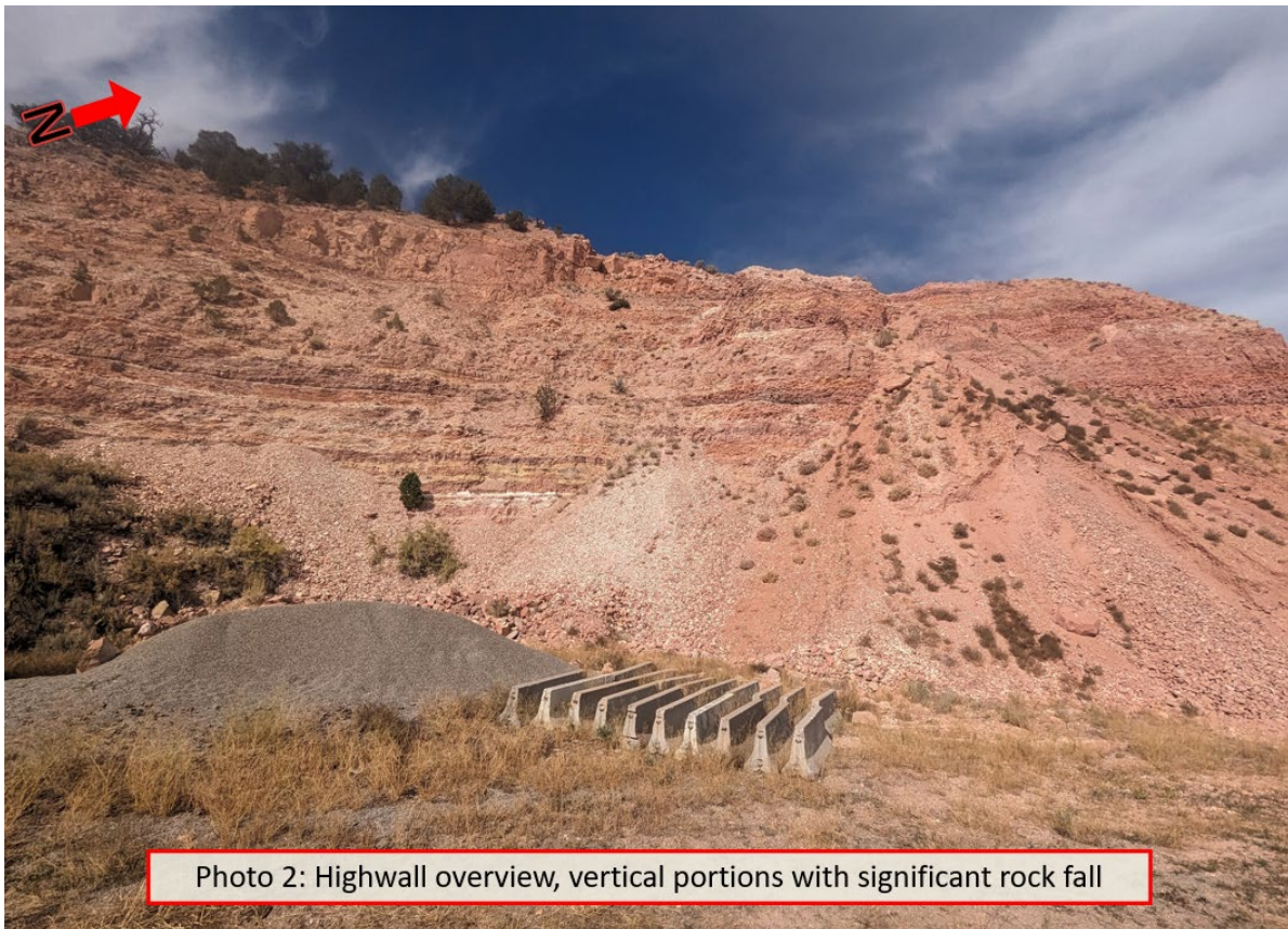
Photo 2: Highwall overview, vertical portions with significant rock fall