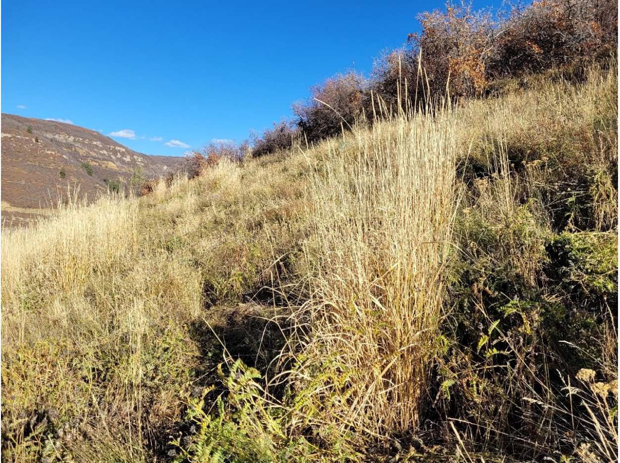
Figure 4. Pad GVB-LW09-05.