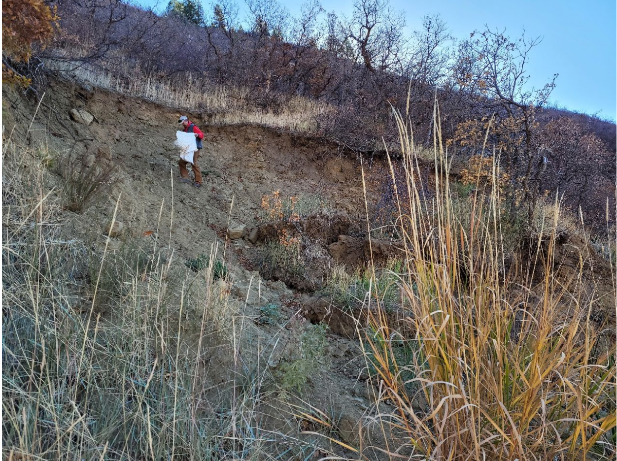
Figure 6. Small slide in undisturbed area along road between pads GVB-LW09-05 and GVB-LW15-01A, -01B, and -02.