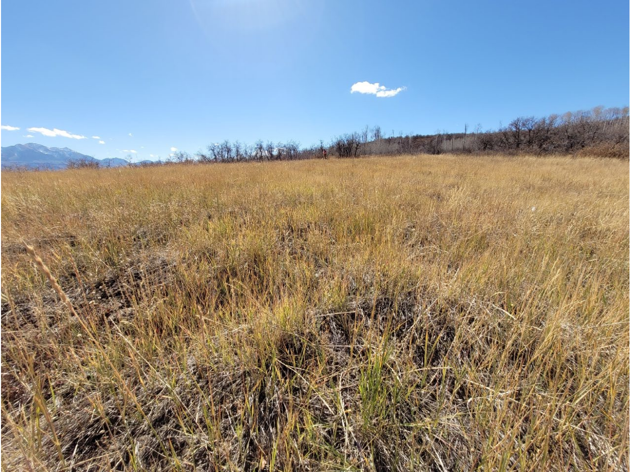
Figure 19. GVB-LW17-09.