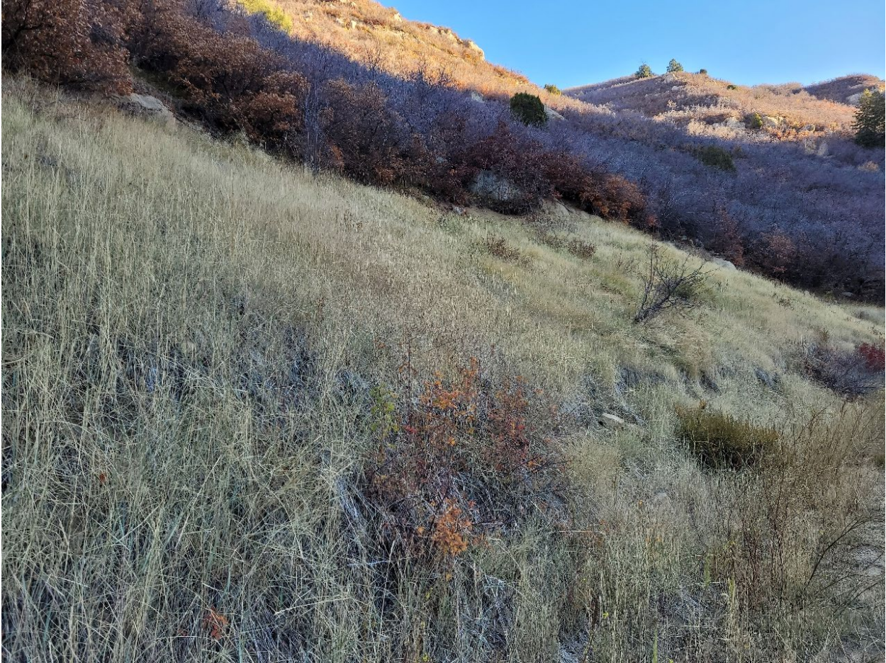
Figure 2. Pad GVB-LW12-03, previously reclaimed and fully released under SL-5.