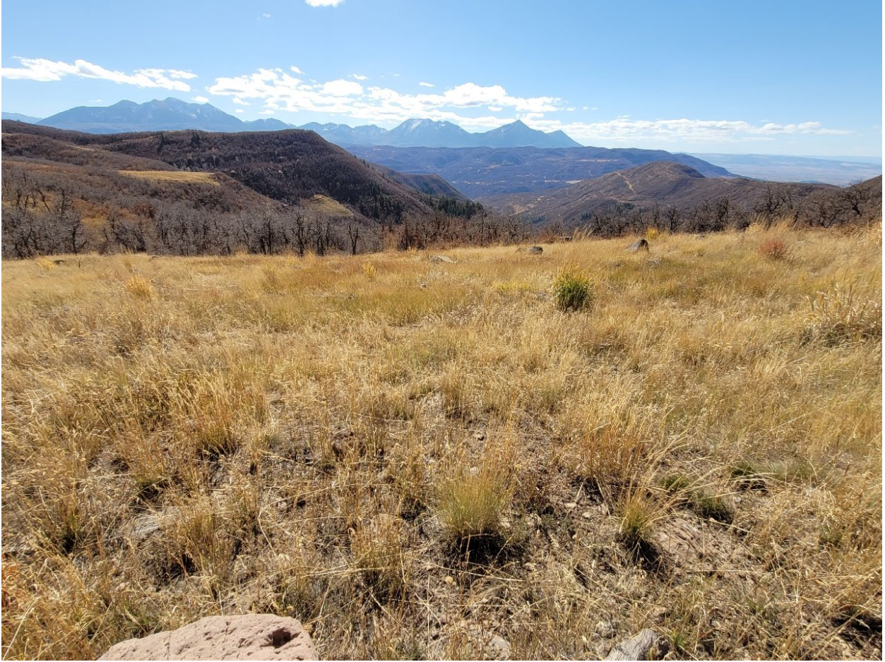
Figure 14. GVB-LW17-03.