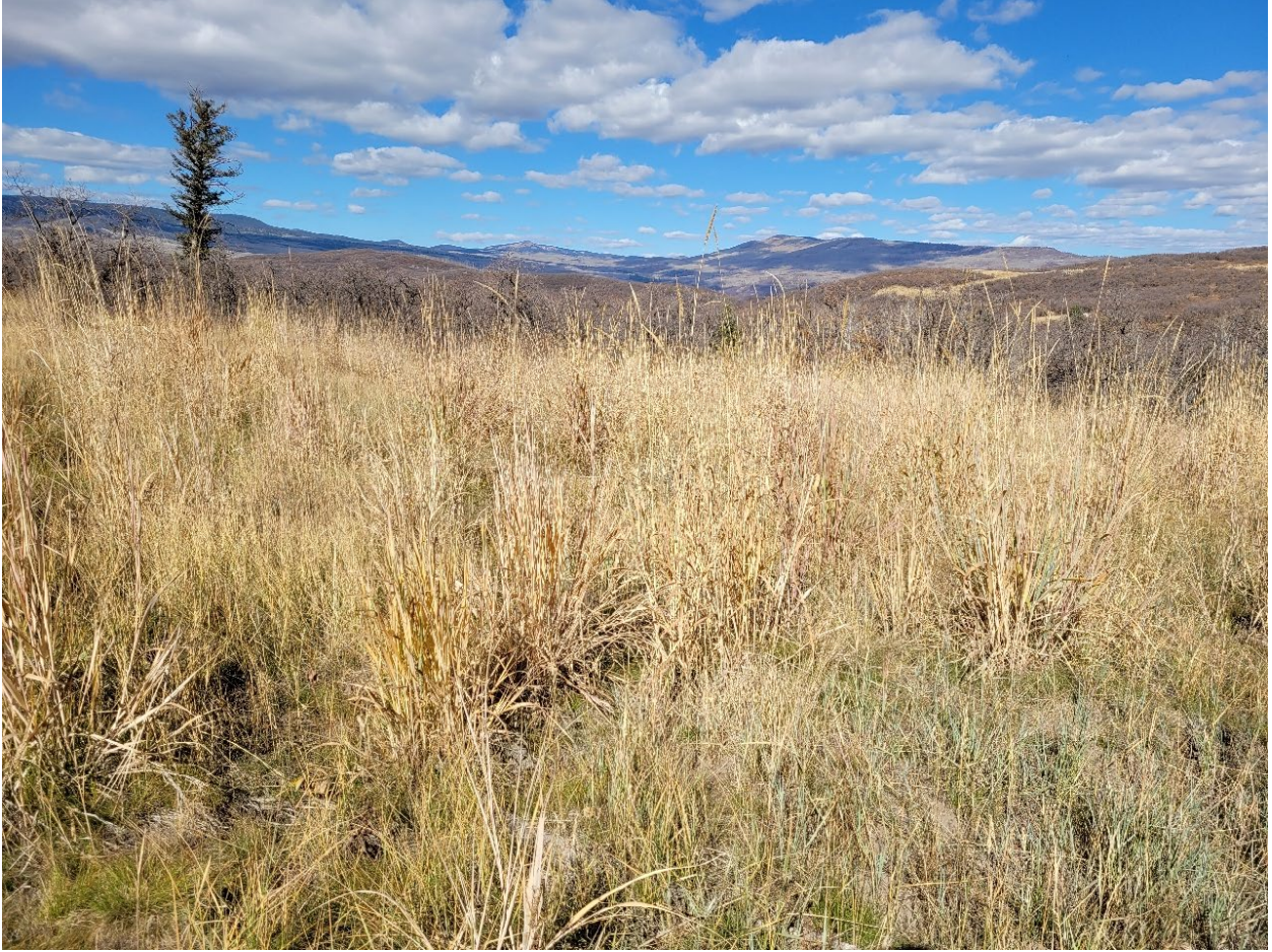
Figure 11. GVB-LW17-01A and -01B.