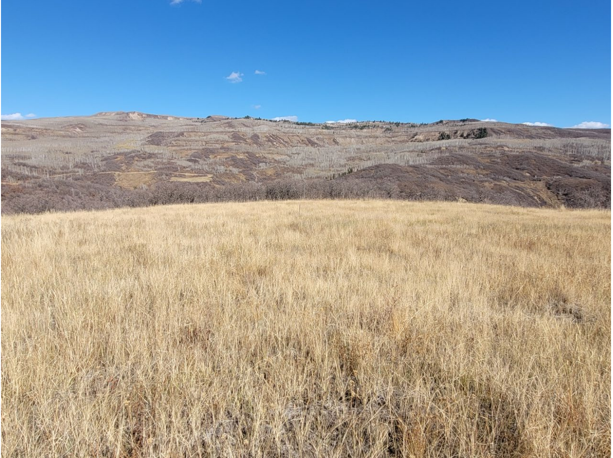
Figure 20. GVB-LW17-09.