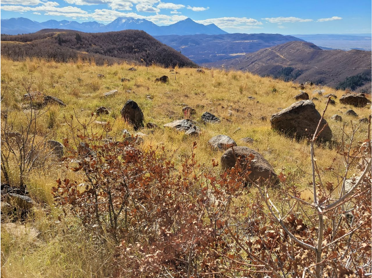
Figure 16. GVB-LW17-04, -04B, and -04C.