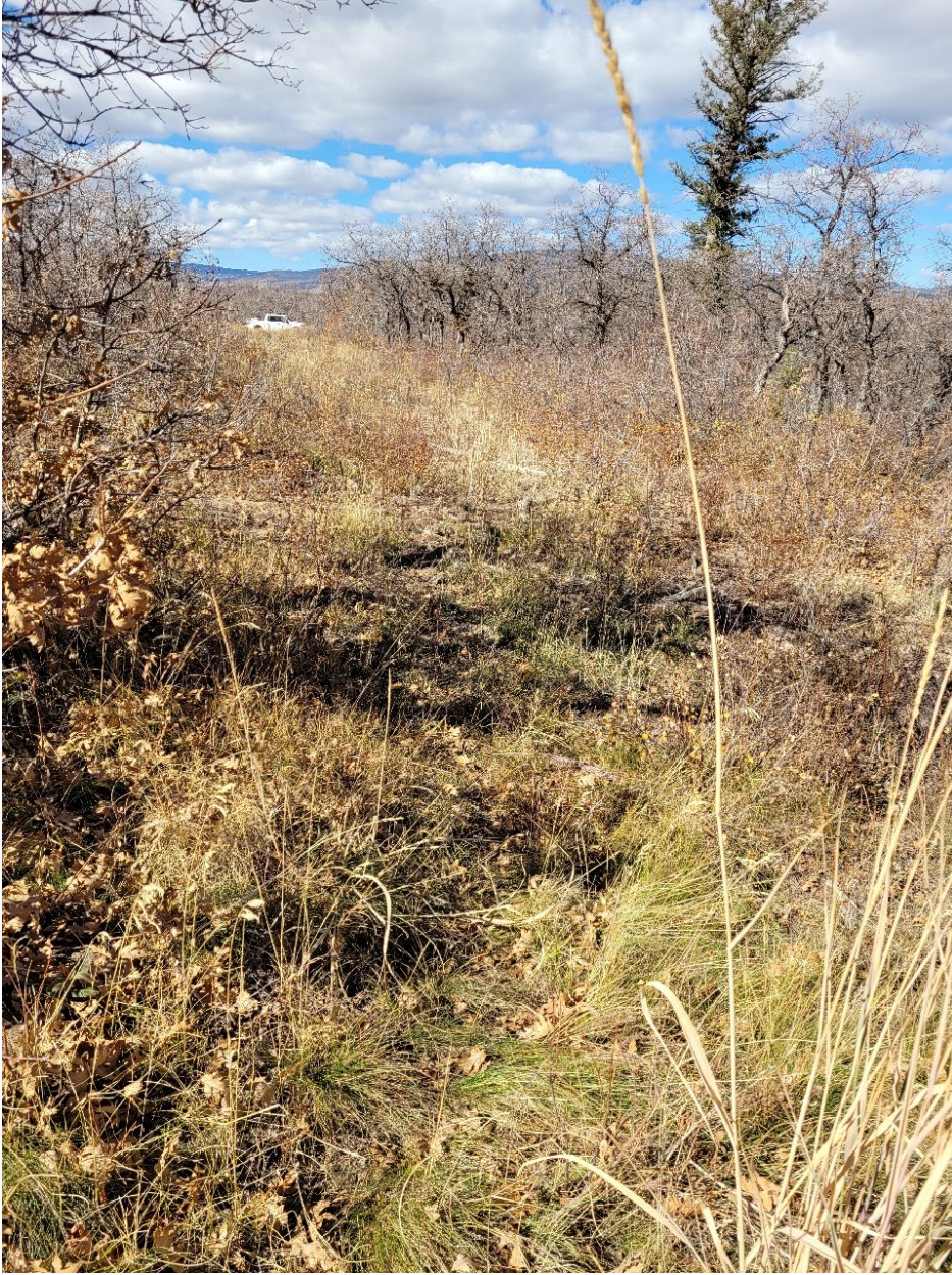
Figure 9. Road to GVB-LW17-01A and -01B.