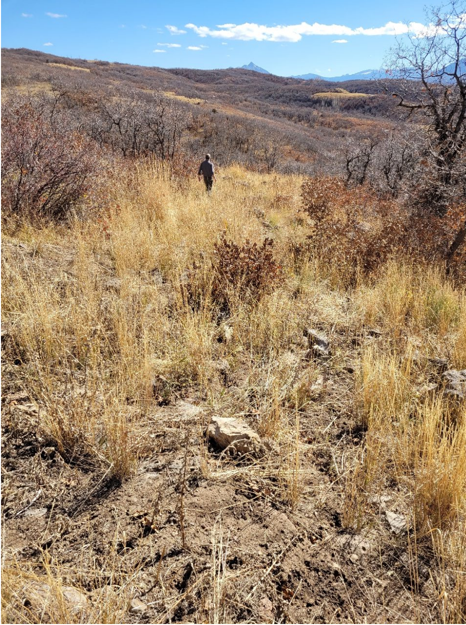
Figure 12. Road to GVB-LW17-03.