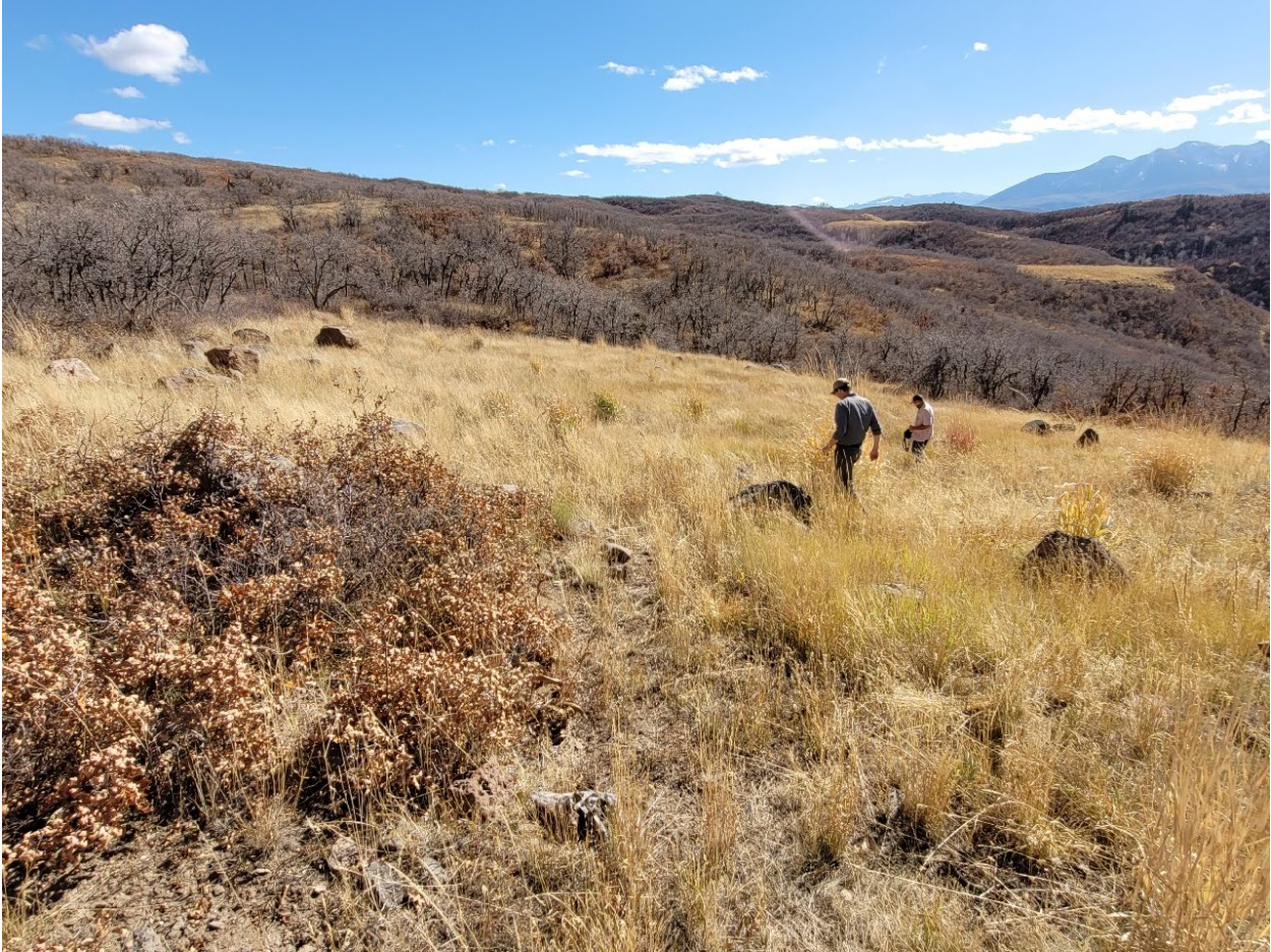
Figure 13. GVB-LW17-03.