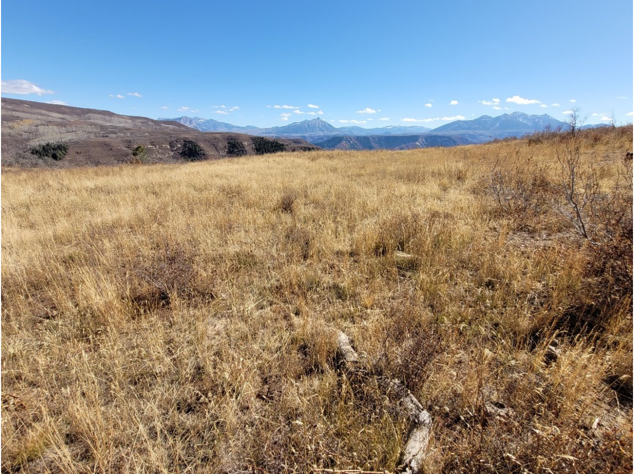
Figure 18. GVB-LW15-08.