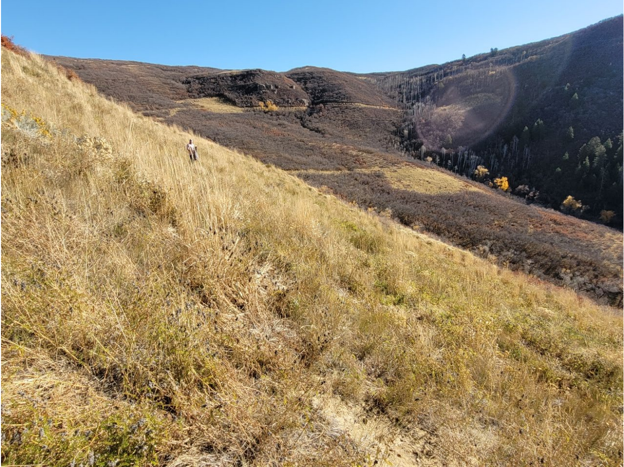
Figure 8. GVB-LW15-01A, -01B, -02.