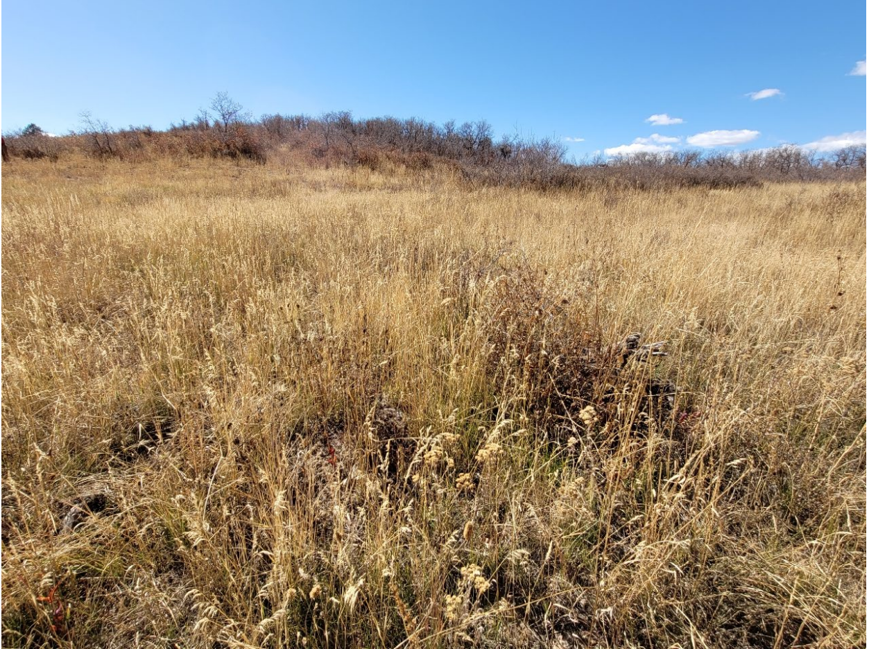
Figure 17. GVB-LW15-08.