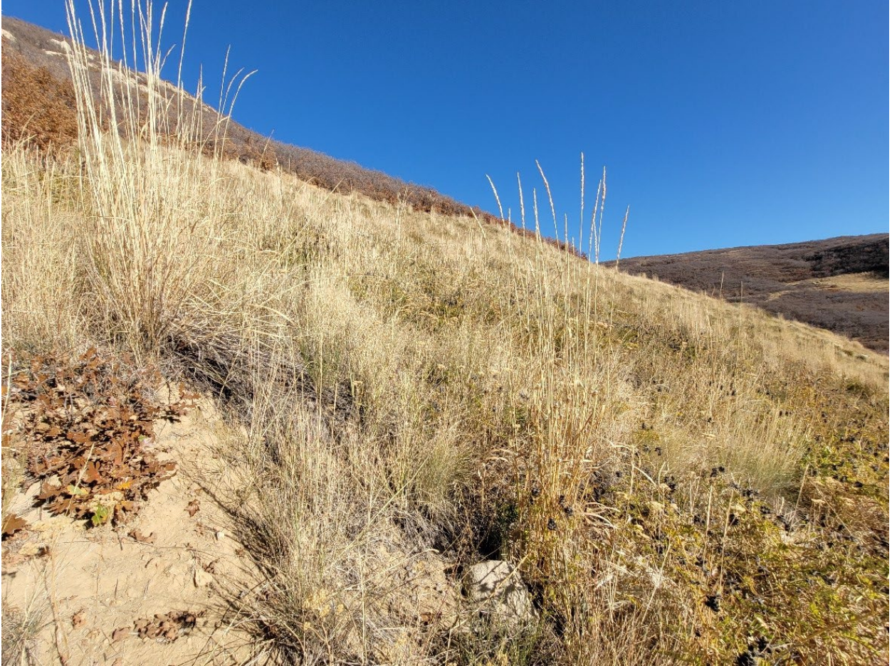
Figure 7. GVB-LW15-01A, -01B, and -02.