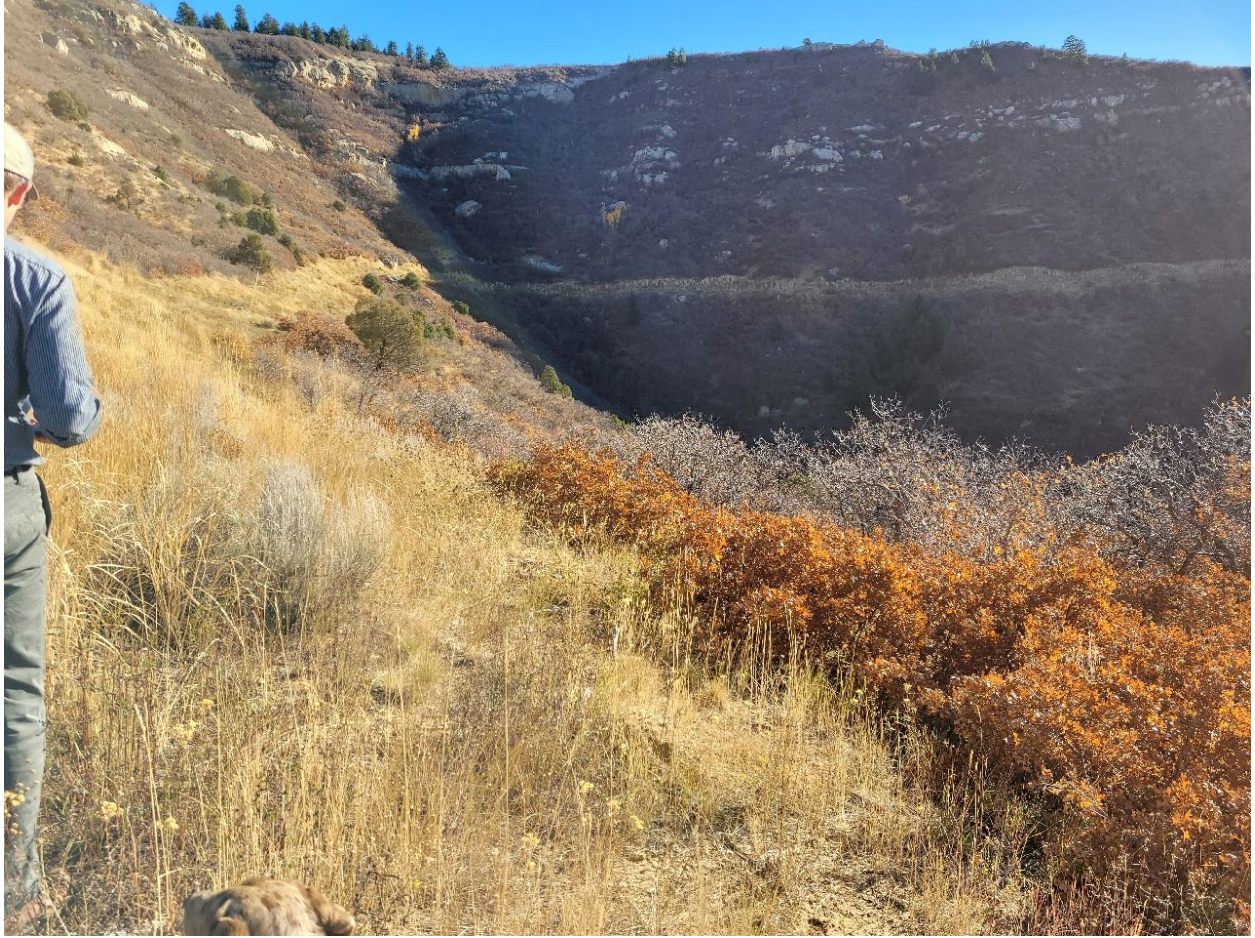
Figure 5. Road to GVB-LW15-01A, -01B, and -02, as seen from GVB-LW09-05.