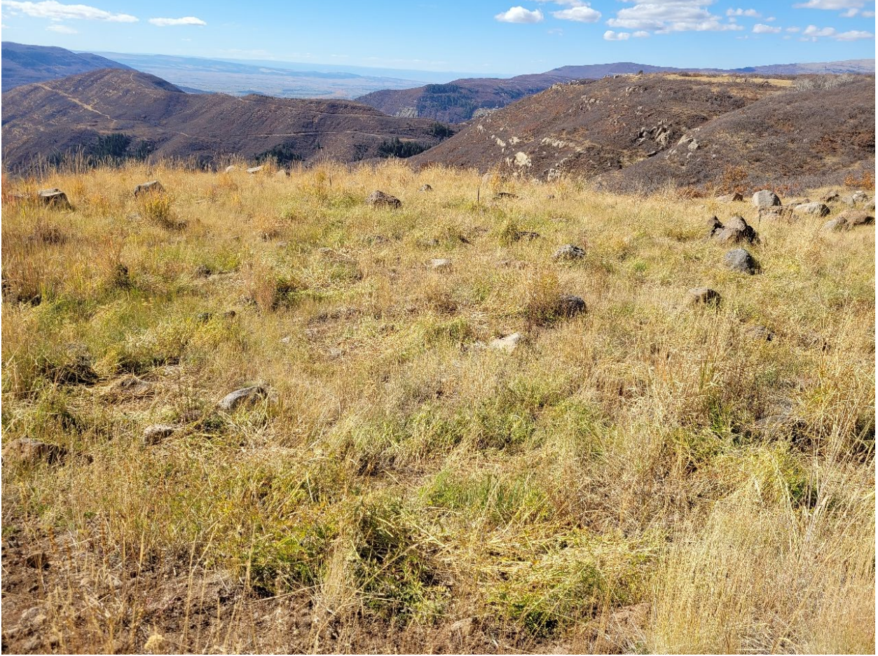
Figure 15. GVB-LW17-04, -04B, and -04C.