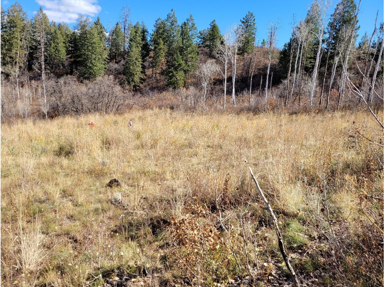
Figure 10. GVB-LW17-01A and -01B.