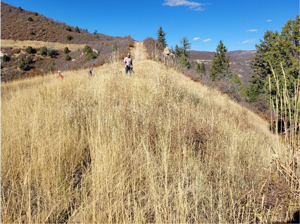
Figure 21. GVB-LW08-03.