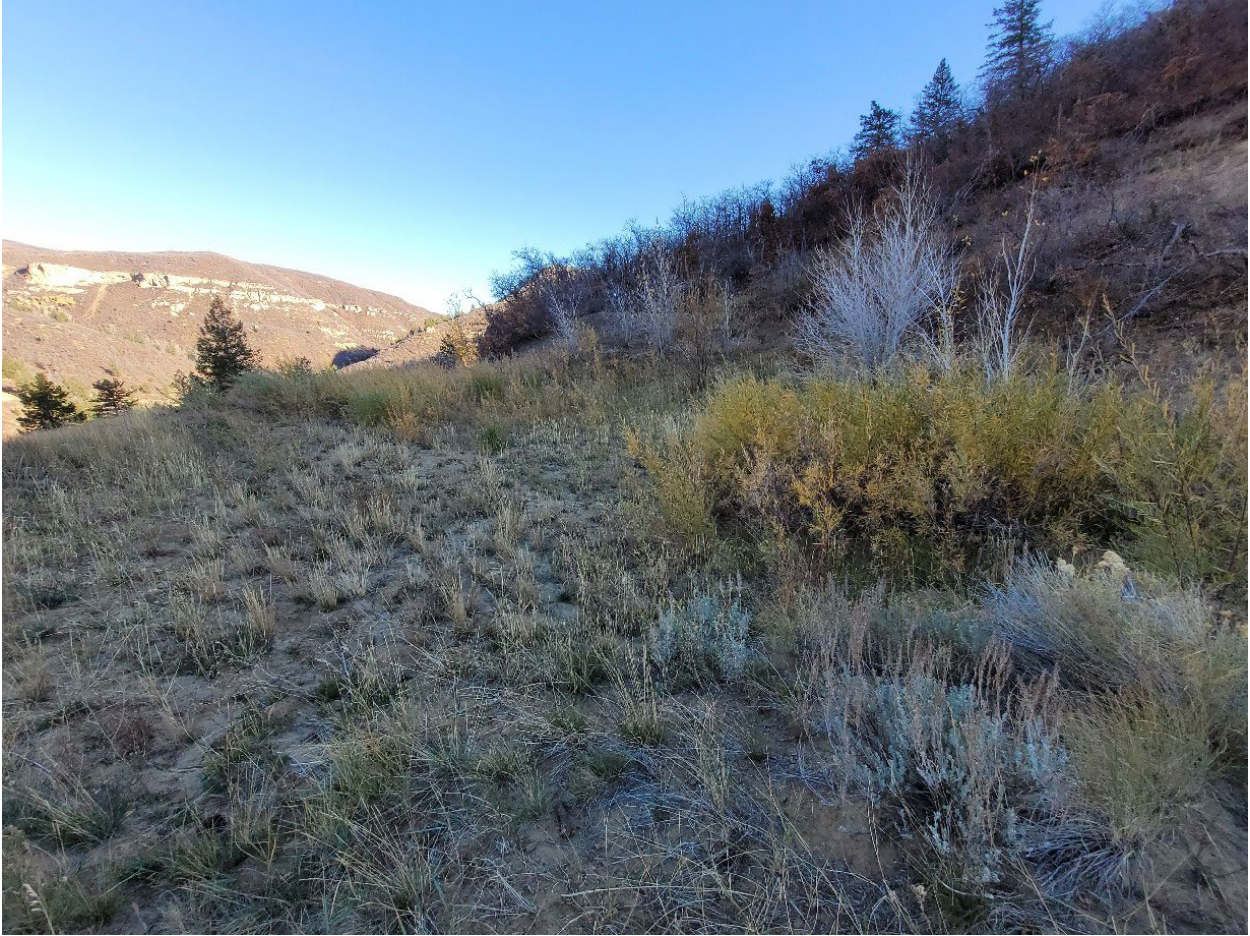
Figure 3. Pad GVB-LW10-05.