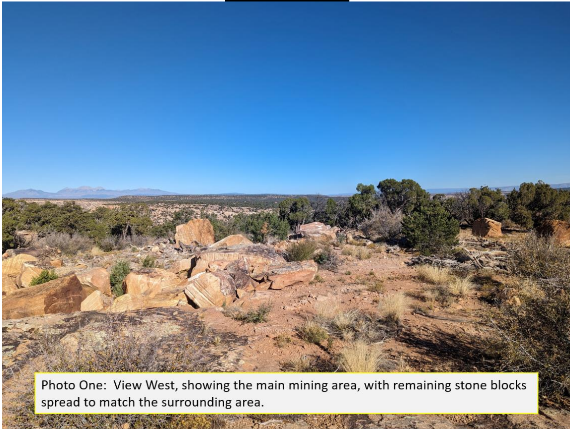
Photo One: View West, showing the main mining area, with remaining stone blocks spread to match the surrounding area.