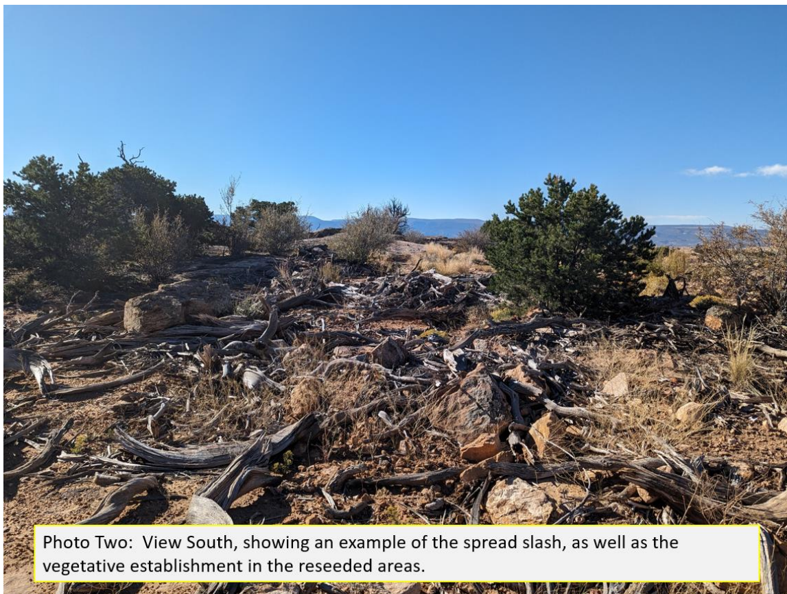
Photo Two: View South, showing an example of the spread slash, as well as the vegetative establishment in the reseeded areas.