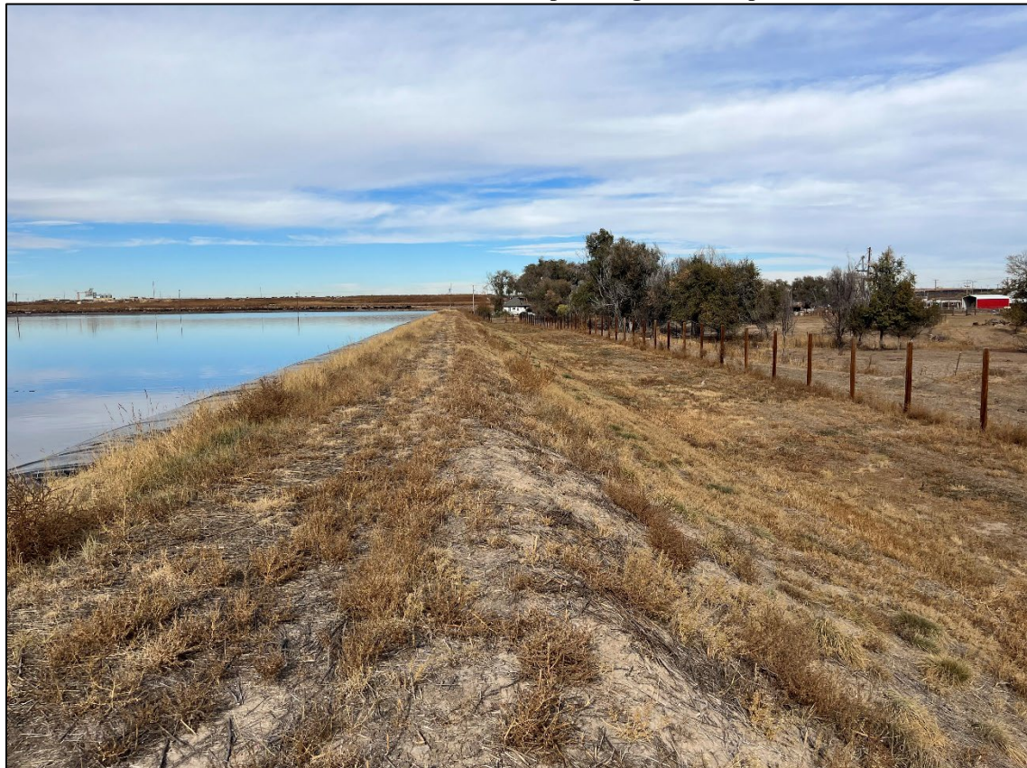
Photo 4: View north of the east facing slope of the agricultural pond.