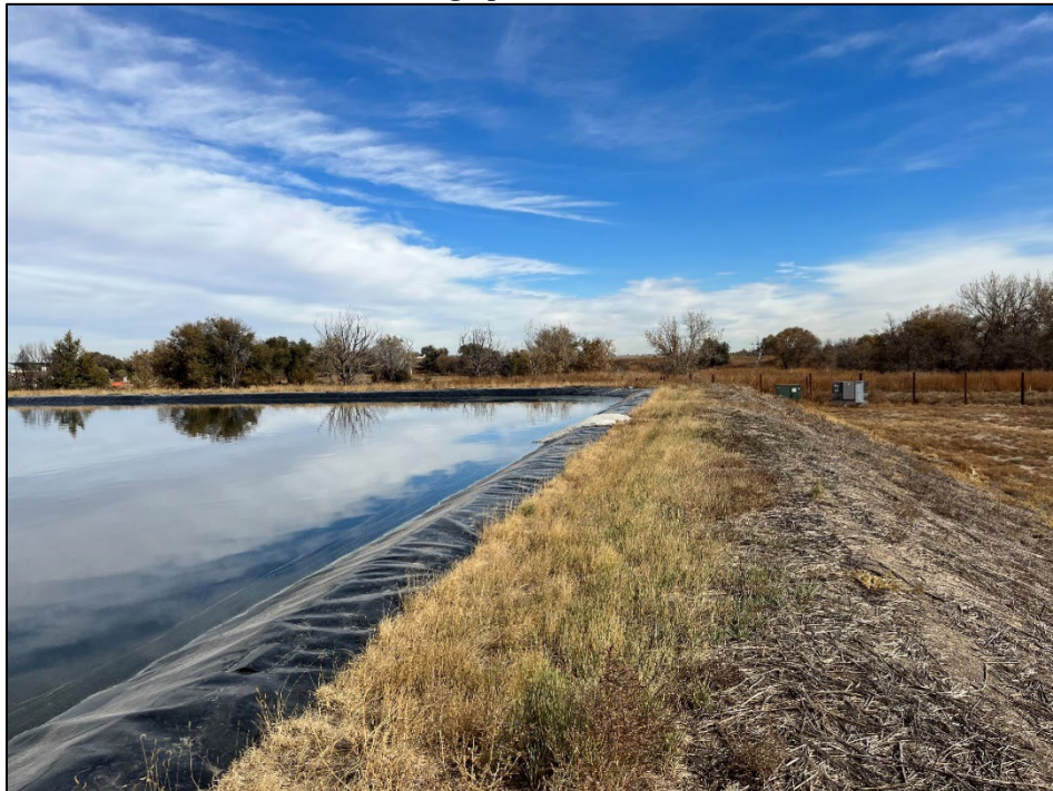
Photo 2: View east of the south facing slope of the agricultural pond.