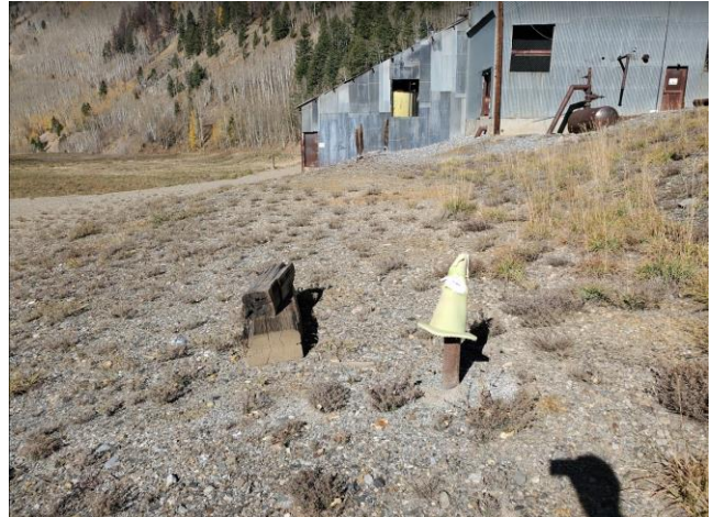
View to the north of pre-collar casing on lower drill pad.