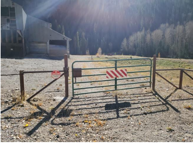
View to the south of gate that secures the property.