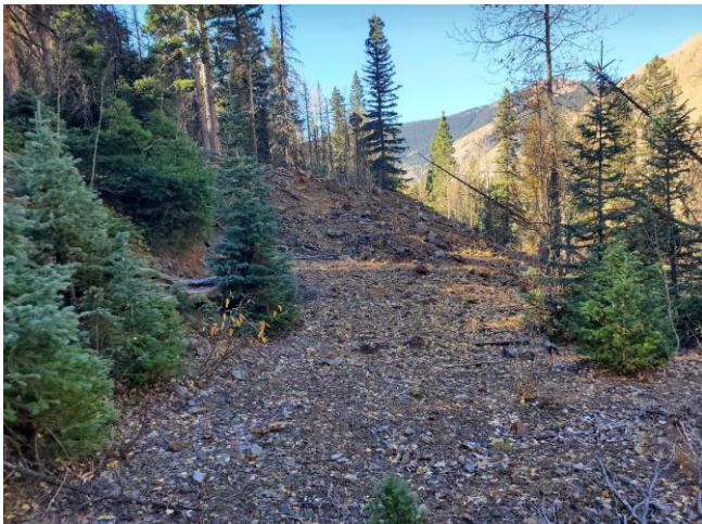
View to the east of sediment flow blocking road to upper drill pad.