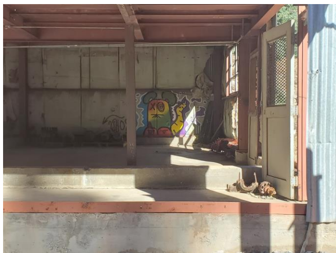
View to the north of graffiti in historic structure near lower pad.