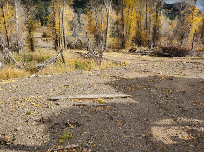
View to the southeast of post with flagging that marks the corners of the permit.