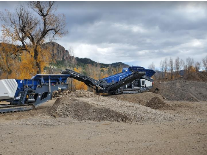
View to the east of processing equipment on site.