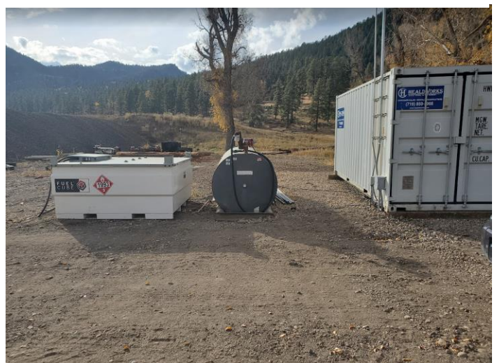
View to the west of hydrocarbon storage in off site support facility.