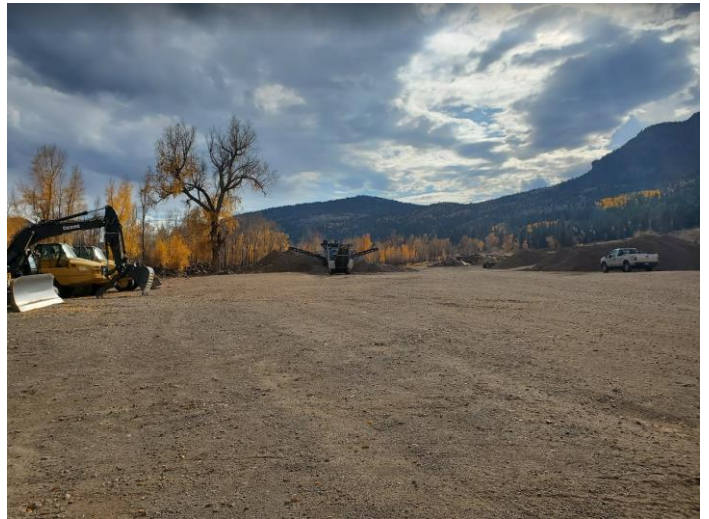
View to the south of processing area. Unprocessed stockpile is located in the center of the photo.