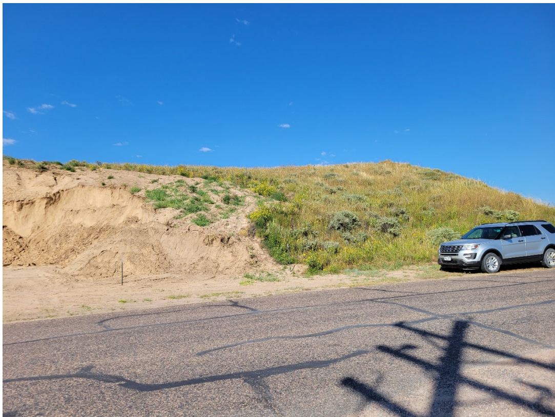
Photo 4: Looking north towards the end of the sand hill, showing type/density of existing vegetation.