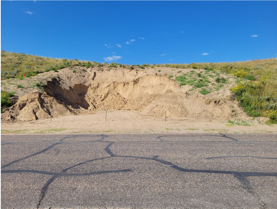
Photo 1: Looking west at the u-shaped excavation from across County Road HH.5.