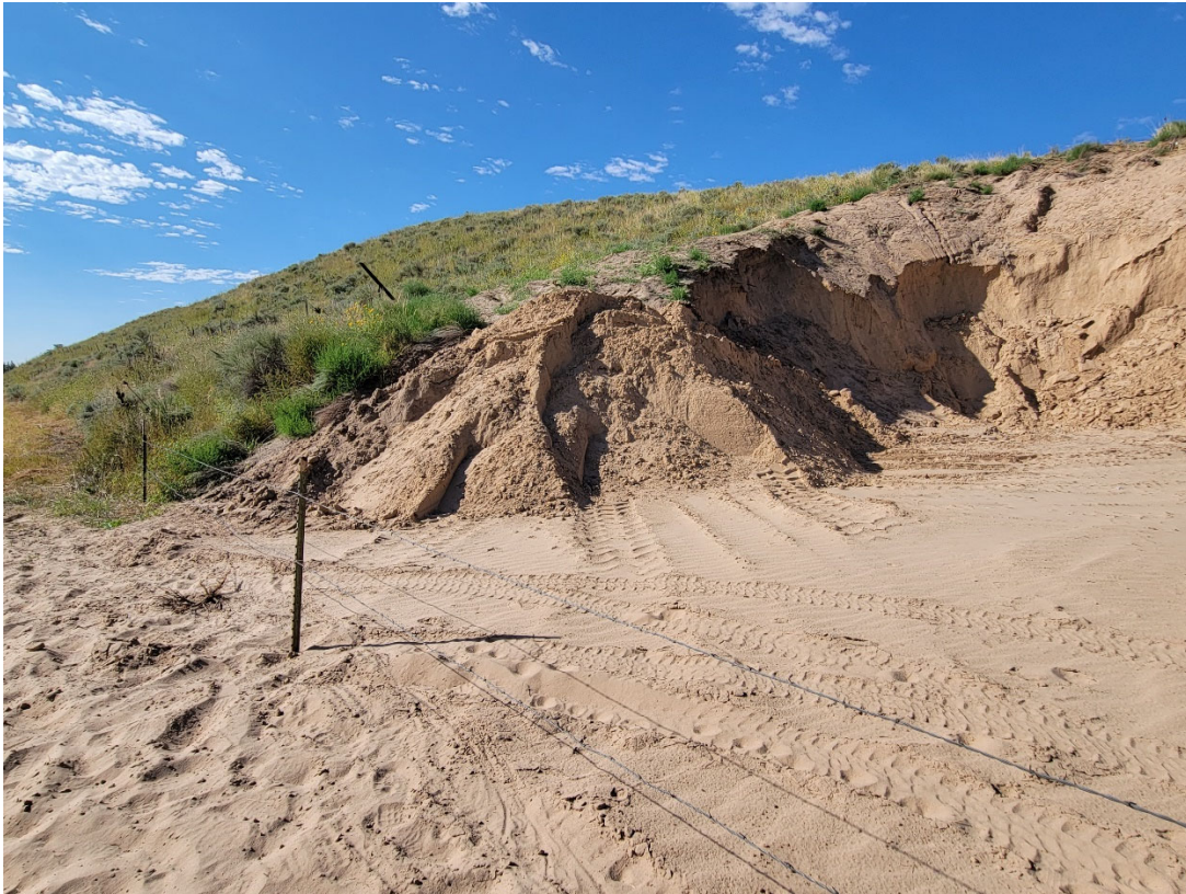
Photo 3: Looking south at the sand hill surrounding the excavation.