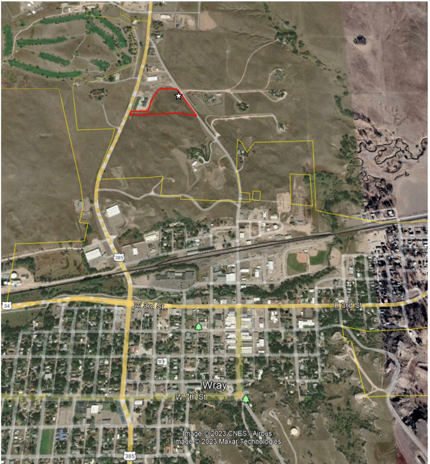
Figure 2: Area map showing the parcel owned by Ritchey's Redi-Mix, Inc., located north of Wray, Colorado.