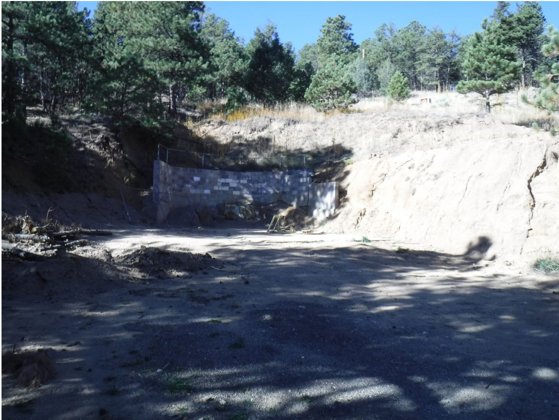
Photo 3: Looking at the location of the former winch house and headframe the highwall, center right of picture, will be scaled back (tiered) to expose the natural bedrock and provide better erosion control and overall stability