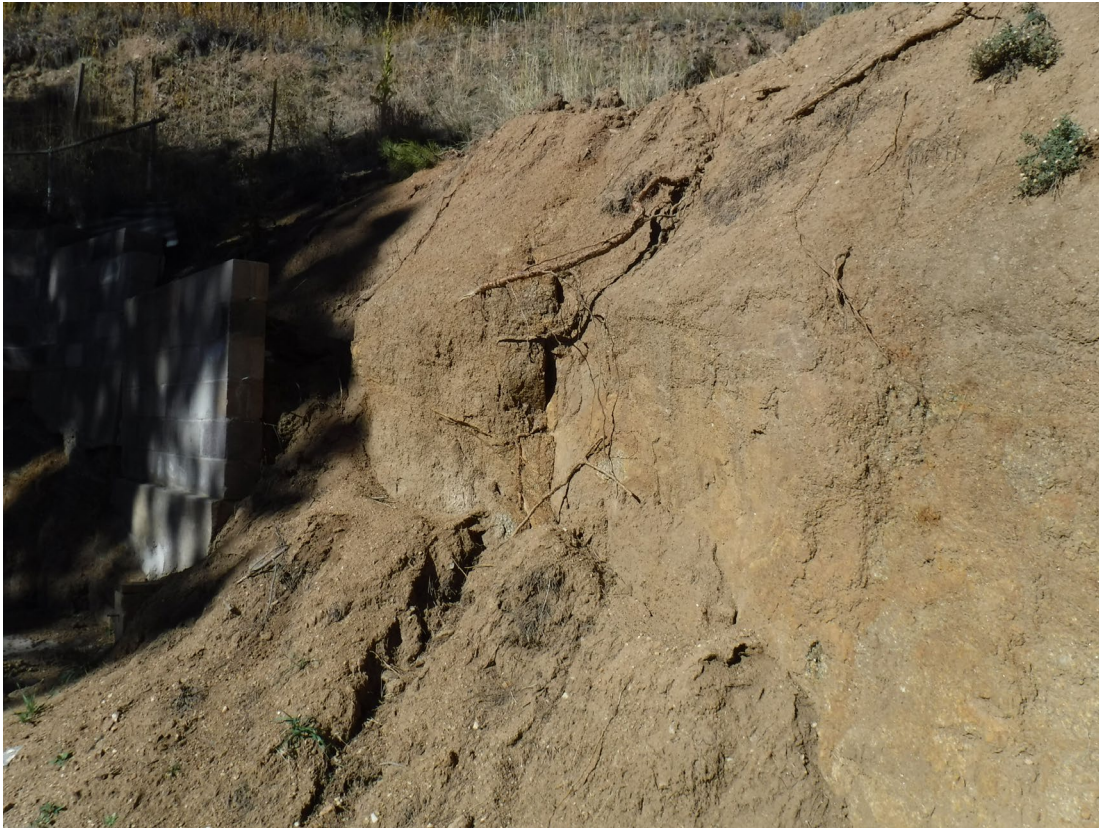
Photo 5: Close-up of highwall and exposed bedrock beneath a veneer of soil