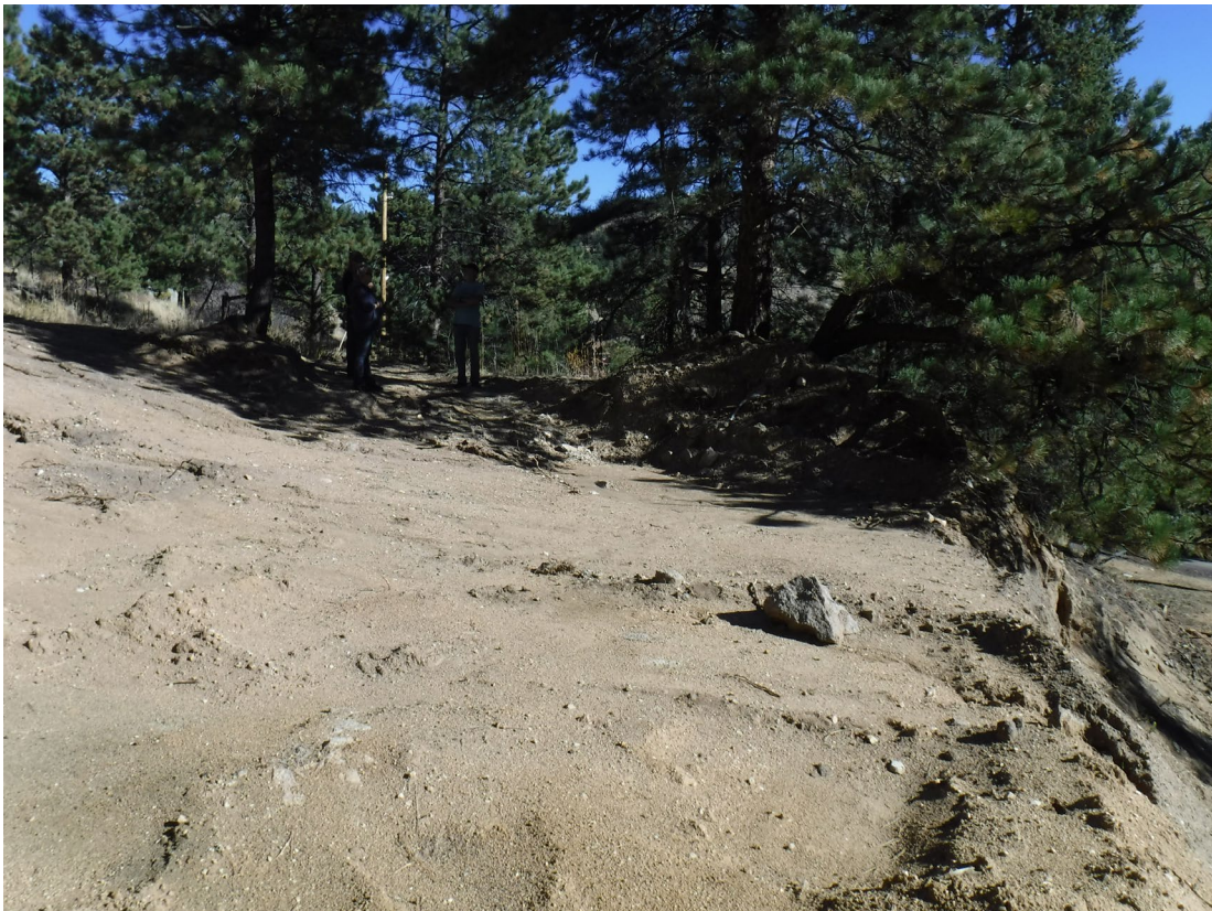
Photo 6: Area upslope from the highwall that is going to be regraded for erosion control and reseeded.