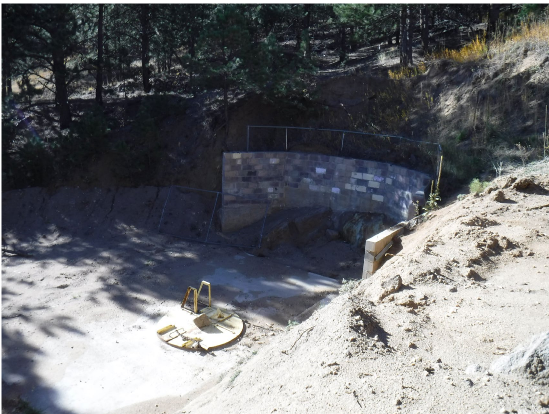
Photo 2: Looking at the location of the former winch house and headframe