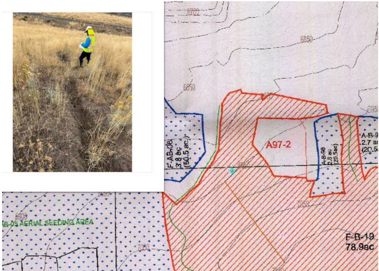
Photo 6: Rill in the west portion of parcel FB19 near the 6950 elevation contour.