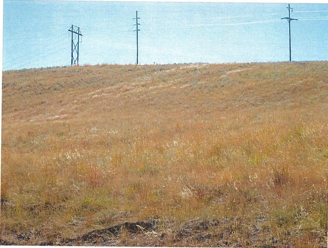
Photograph 3: East Side of the Fill Looking South-west (10/17/2023)

Photograph 3 depicts the east facing slope of the fill.