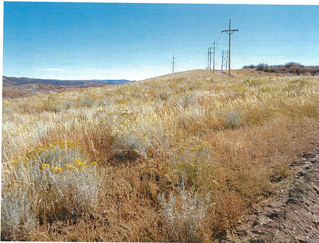
Photograph 1: East Side Looking South (10/17/2023)

No appearances of instability, structural weakness, or other hazardous conditions were observed. Both the southeast side of the fill and the northeast side of the fill were inspected this quarter (Photographs 1 and 2). The area where cracks were detected on the top south portion of the dump during the first quarter of 2013 inspection was checked. There was no additional cracking found.