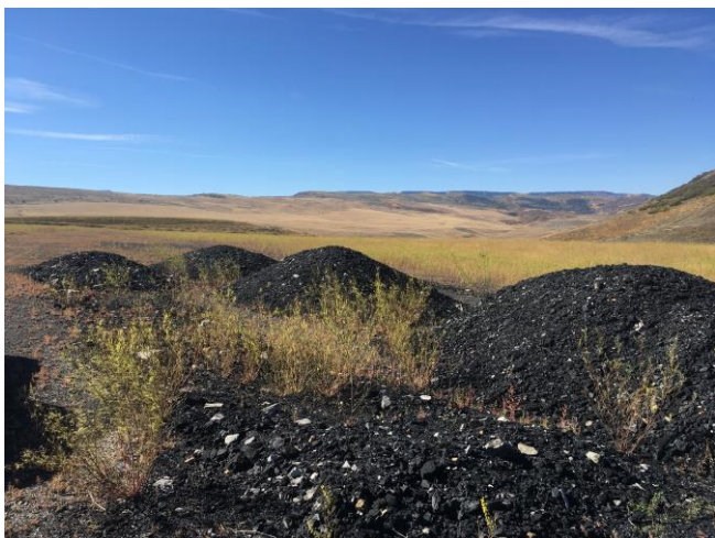
September 29, 2023- Areas 2, 3 and 4