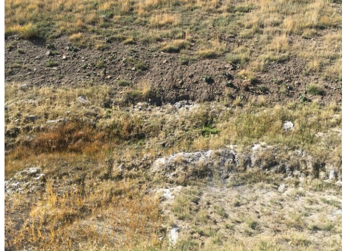
September 29, 2023-Seepage Area