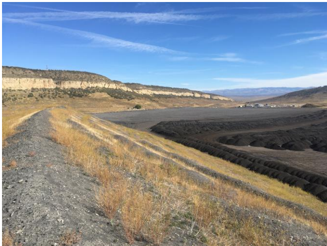
September 29, 2023- Expansion Area from Areas 2, 3 and 4