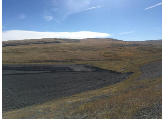
September 29, 2023- SW End of Drain in Expansion Area