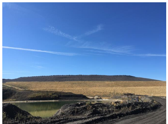
September 29, 2023- Benches on East Side of Refuse Pile