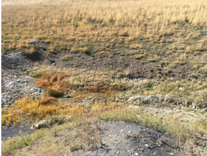
September 29, 2023-Drain Outlet and Seepage Area