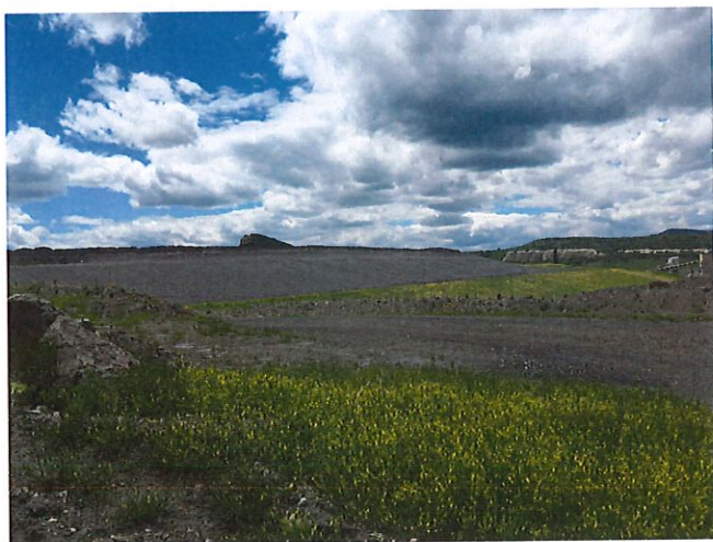
June 30, 2020-3 rd Bench on East Side of Refuse Pile