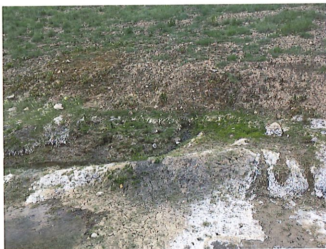
June 30, 2020- Seepage Area