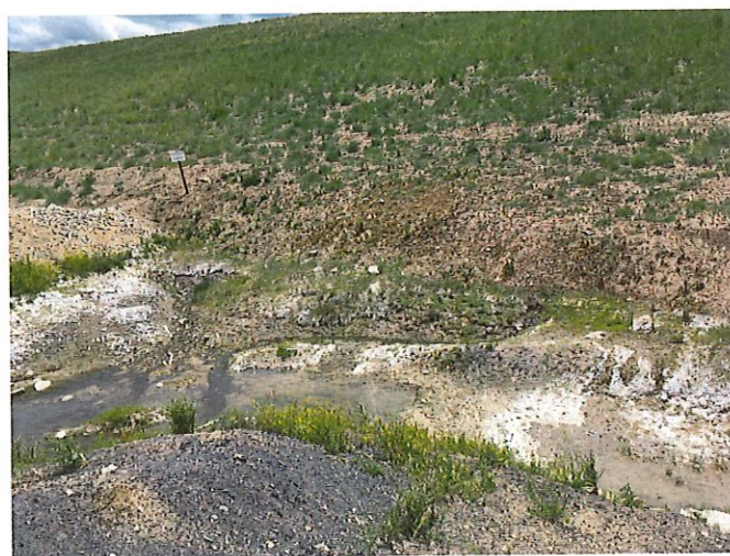
June 30, 2020-Seepage Area and Drain Outlet