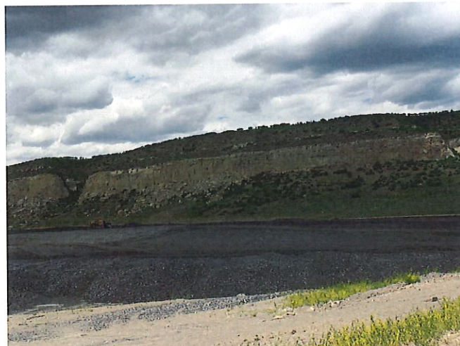
June 30, 2020-Expansion Area Grading