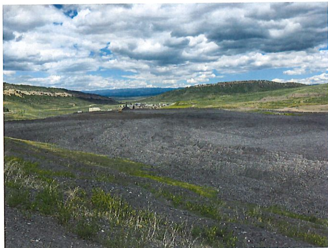
June 30, 2020-Expansion Area from Area 2, 3, 4