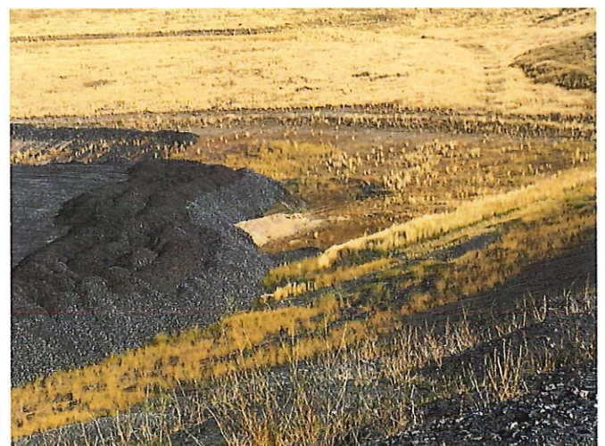
September 30, 2019- Southwest End of Drain