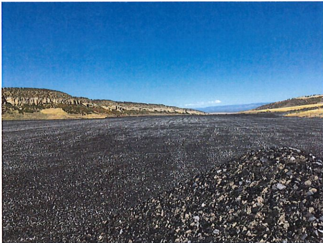
September 30, 2019- Expansion Area