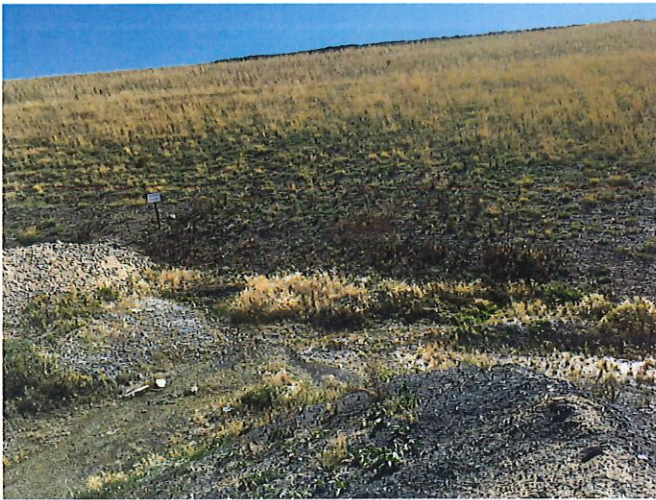
September 30, 2019-Drain Outlet/Seepage Area