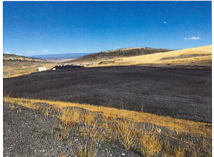
September 30, 2019-Expansion Area from Areas 2, 3, 4