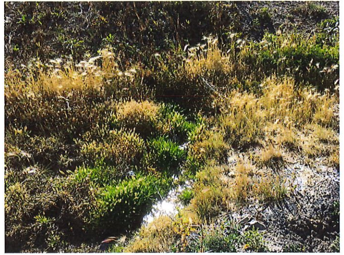
September 30, 2019-Seepage Area