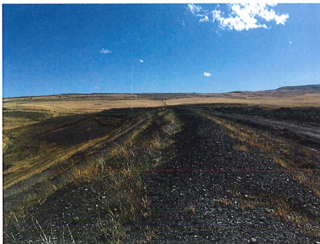
September 30, 2019-Areas 2, 3, 4