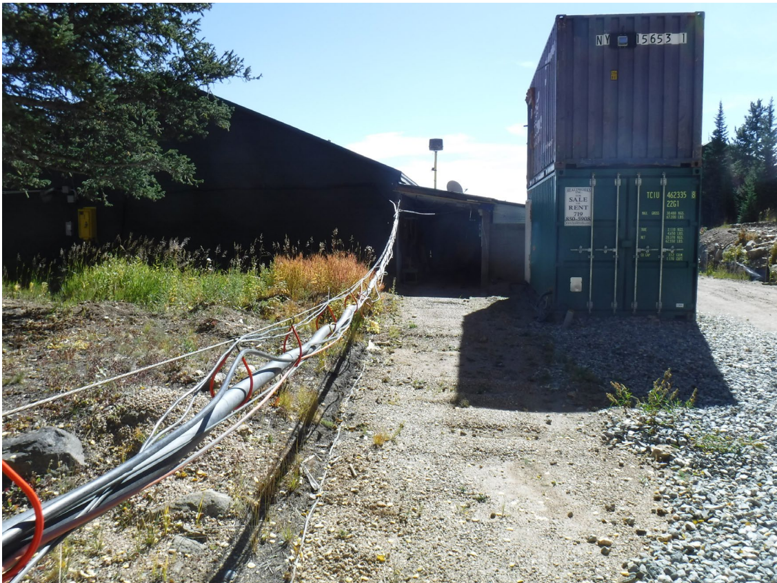
Photo 8: Approximate location of the snowshed to be built and new water treatment system location