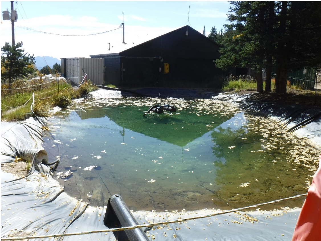
Photo 6: Pond 1, water treatment system in the CONEX boxes (center left)