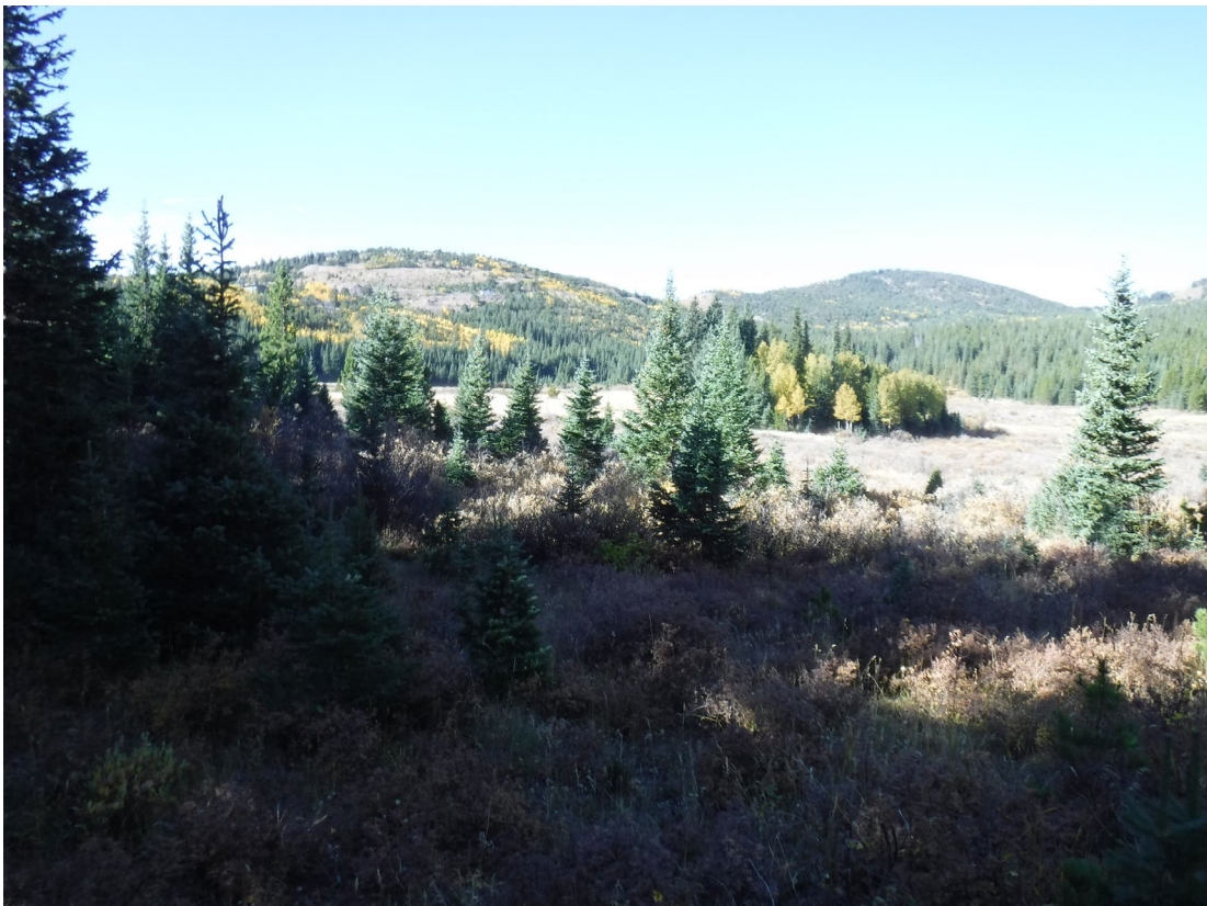
Photo 2: Looking south from where the access road is towards drill location