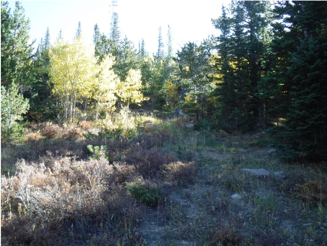
Photo 3: Looking east from where the access road is towards FS 505