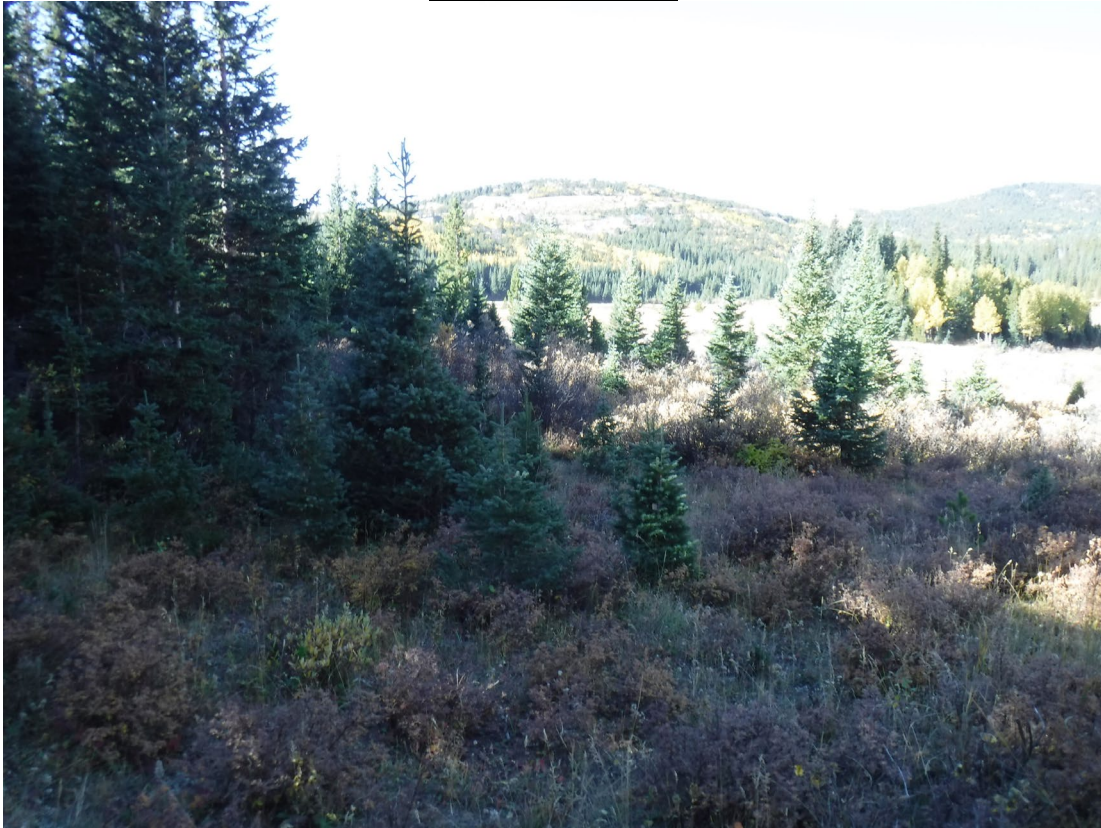
Photo 1: Looking south from where the access road is towards drill location