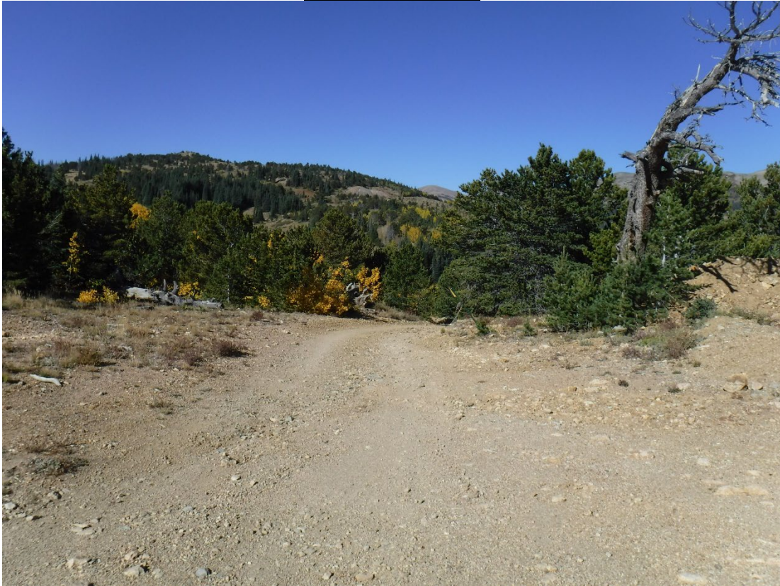
Photo 1: Looking west from the drill pad to where the spur road reaches the drill location