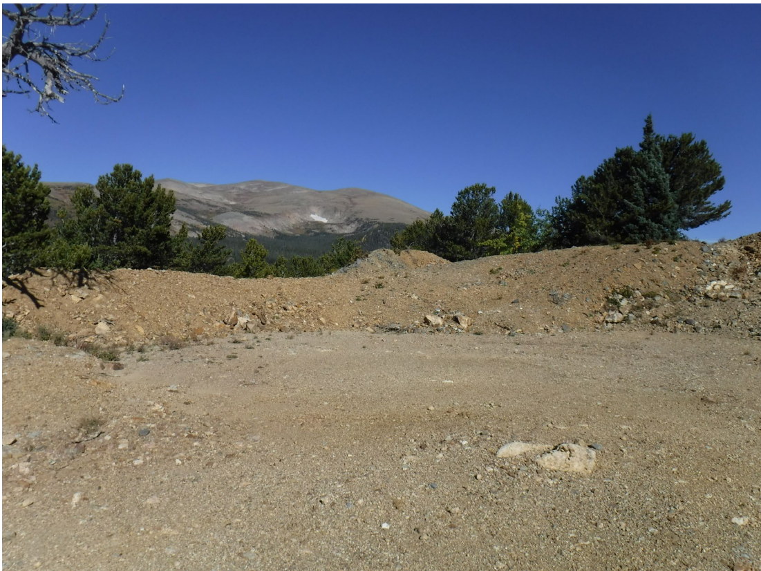
Photo 2: Looking at the western half of the drill pad, looking north