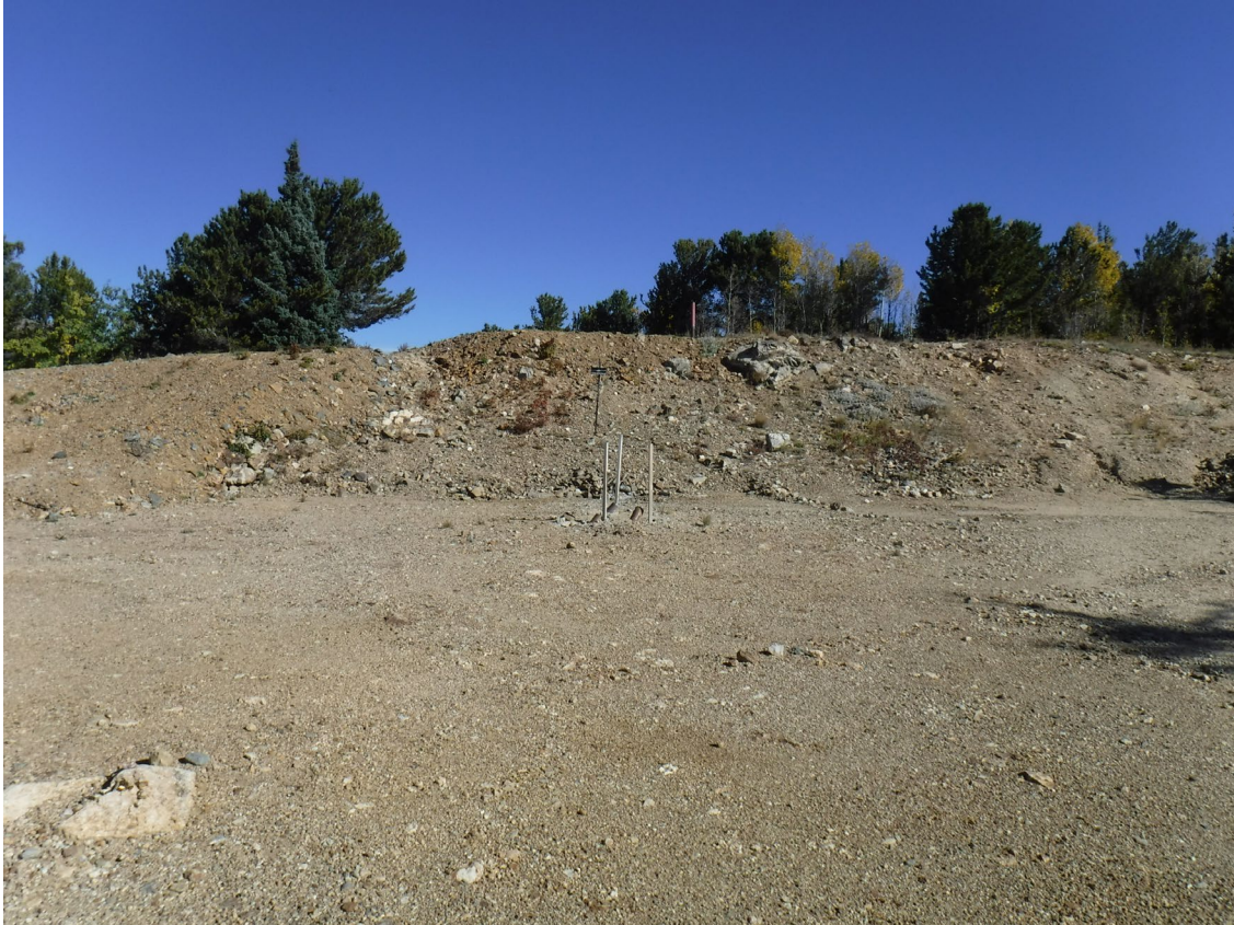
Photo 3: Looking at the remaining areas of the drill pad, looking north