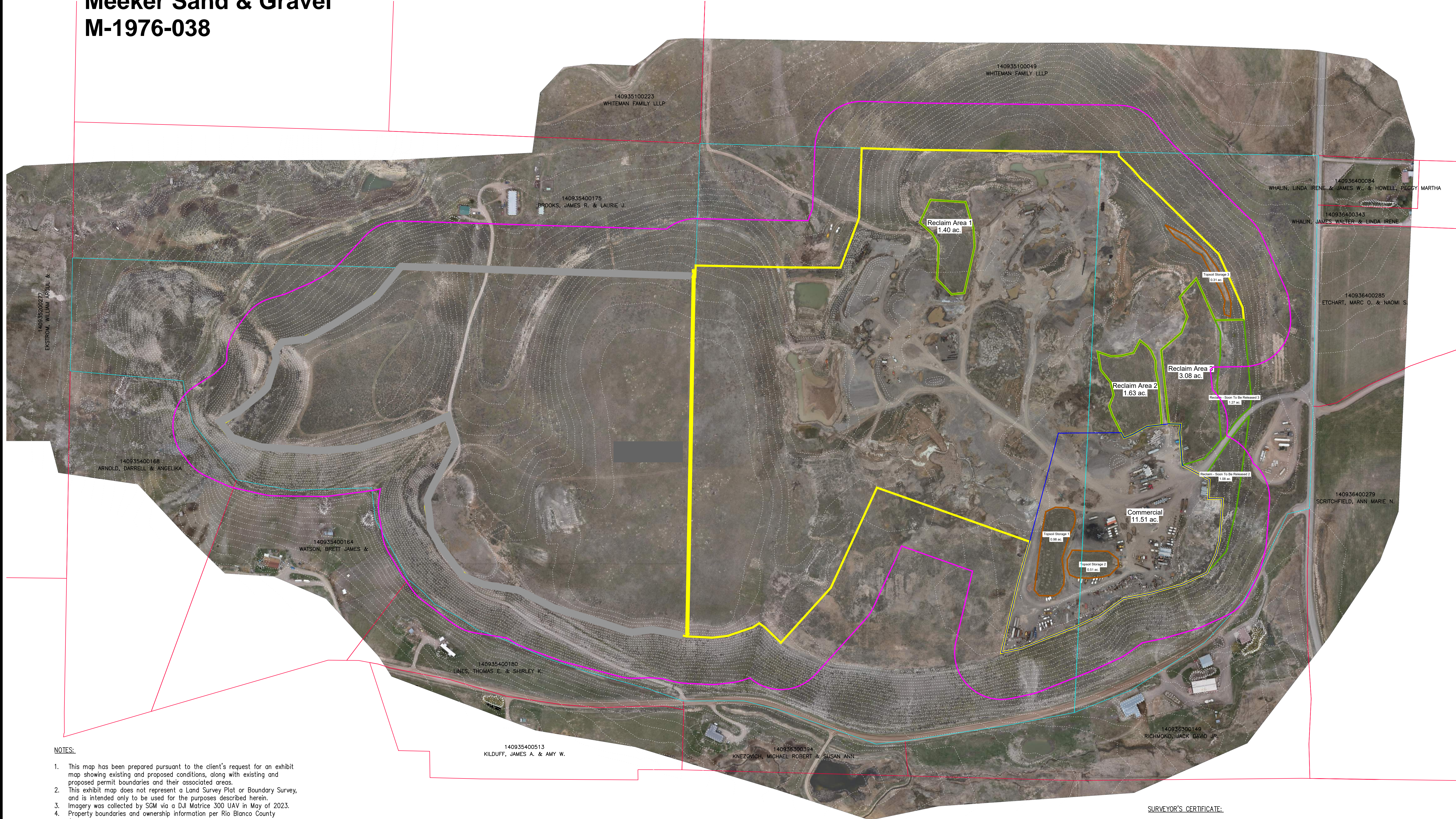
EXHIBIT C-2 Current Mining Map Meeker Sand & Gravel M-1976-038

Township 1 N., Sections 35 & 36, Range 94 W. of the 6th P.M. Rio Blanco County, Colorado