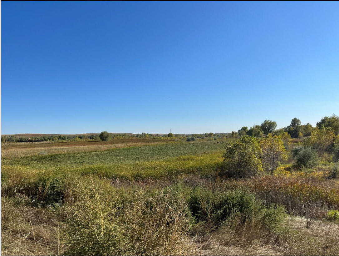
Photo 4: View northeast from atop the easternmost boundary of the AR2 release area into the City of Longmont Parcel 3.