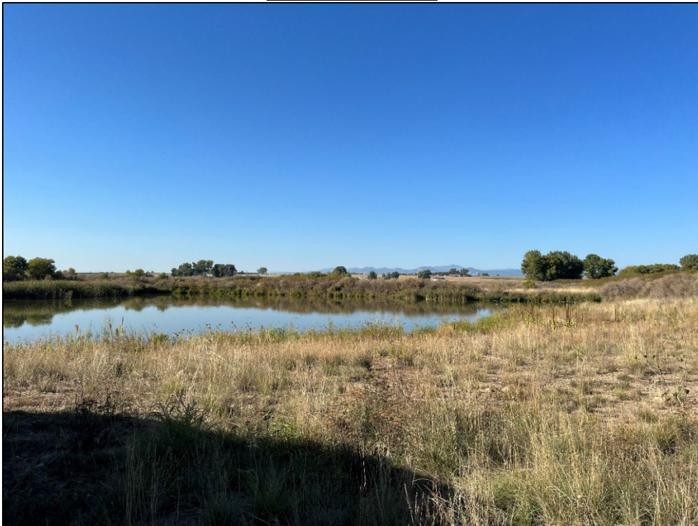
Photo 1: View south of a pre-existing pond feature in the westernmost City of Longmont Parcel 3.