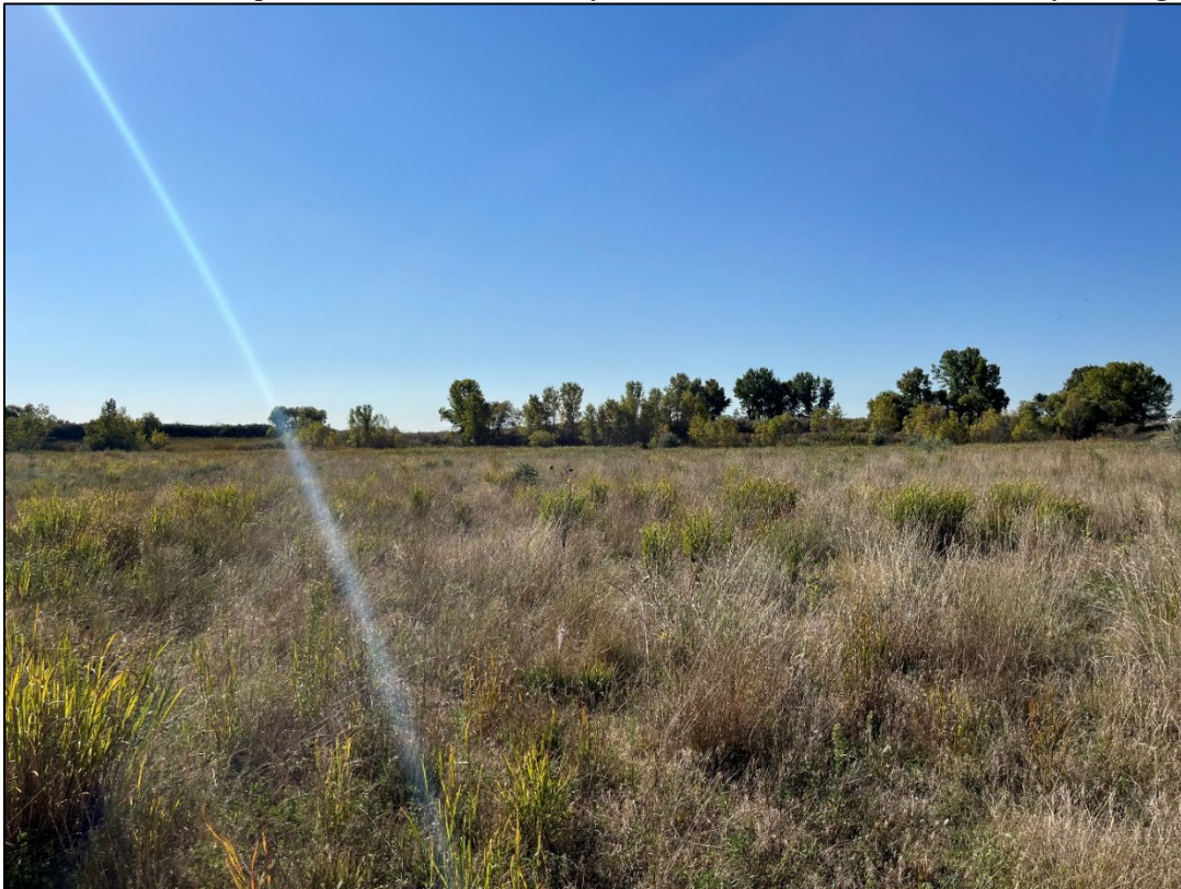
Photo 5: View east into City of Longmont Parcel 3, a fair amount of native grasses have been reestablished here.