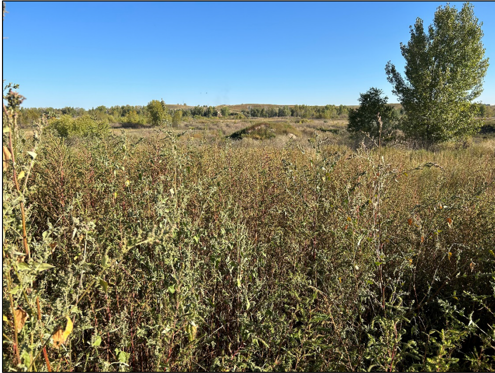
Photo 2: View north of topsoil pile which remains within the permit boundary in the City of Longmont Parcel 1. This area was heavily impacted by the 2013 flooding of the St. Vrain River.