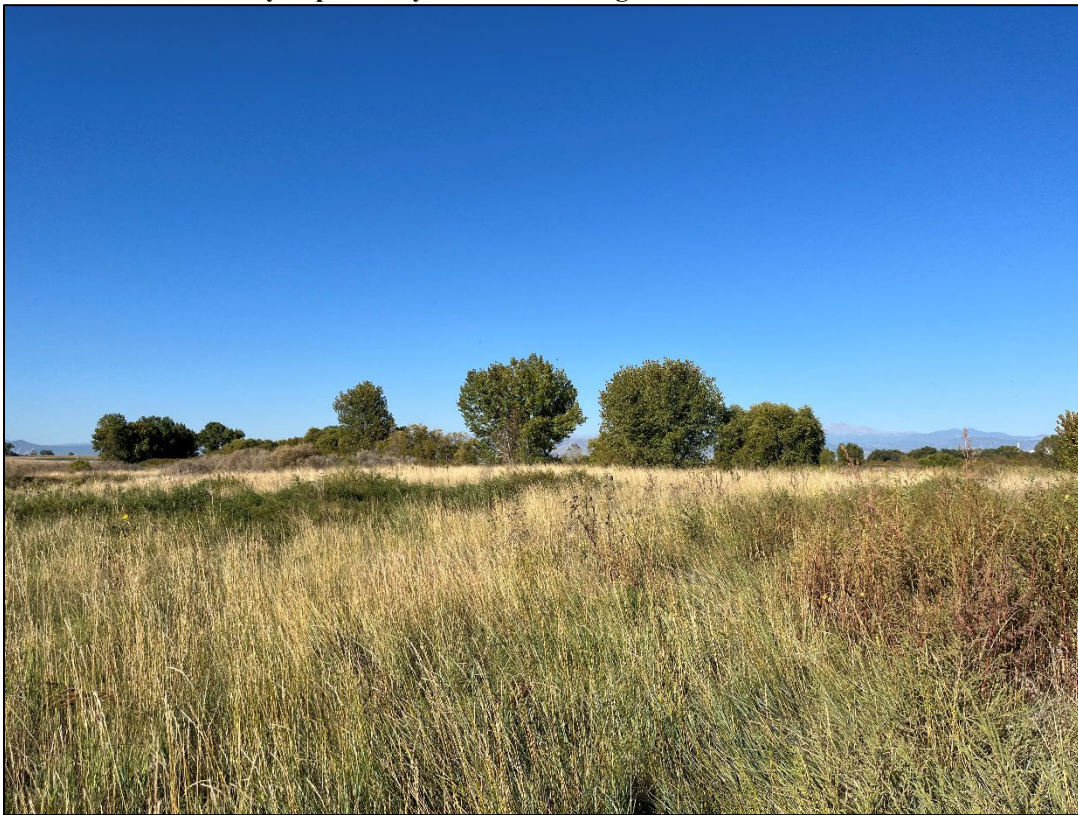
Photo 3: View southwest of a portion of the City of Longmont Parcel 3.