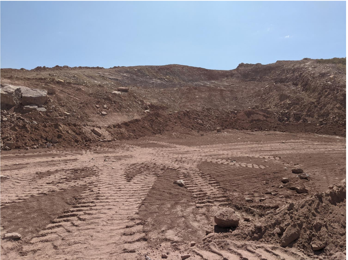
Current location of operations.