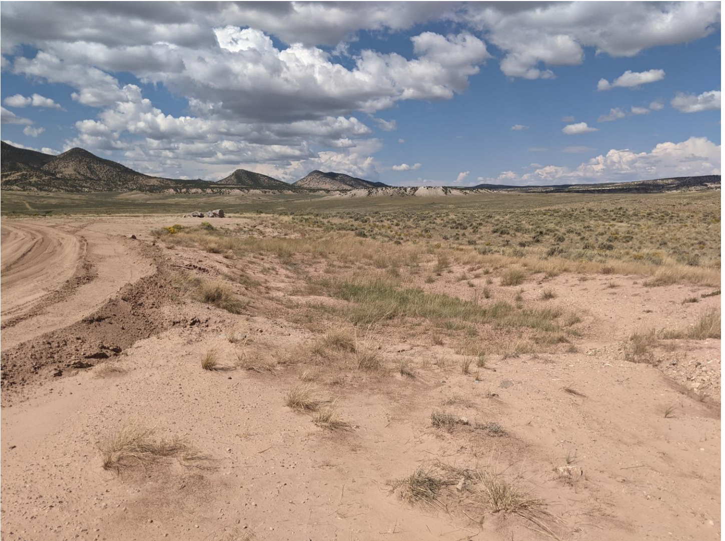
Pond along northern portion of the site.