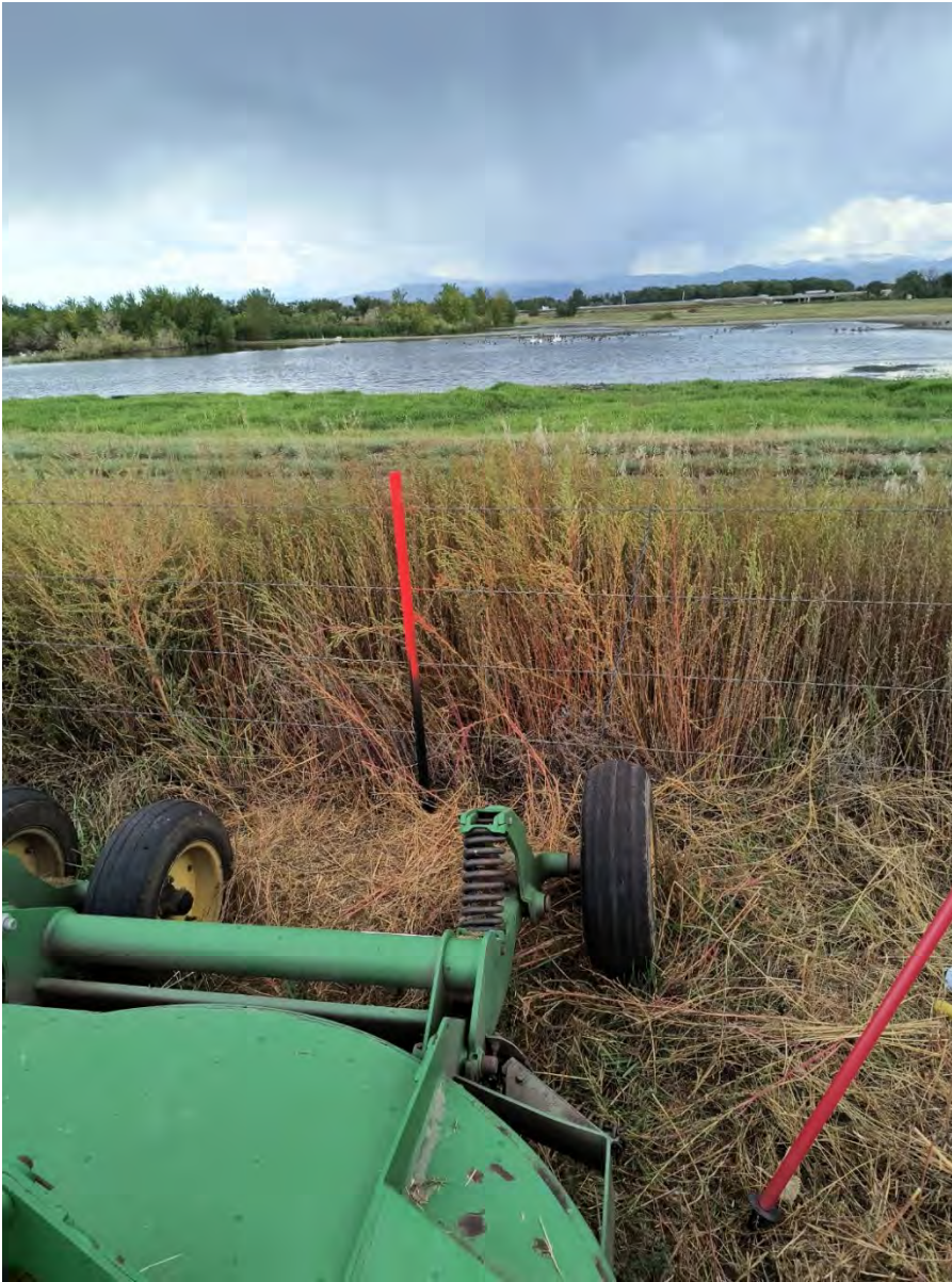
Plate 5. SE Corner looking from the East