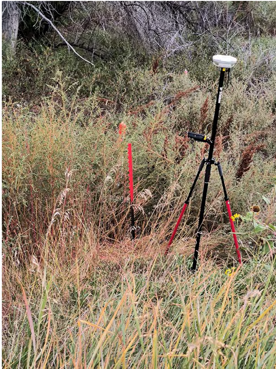
Plate 1. SW corner near the toe of the roadway embankment looking from the West.