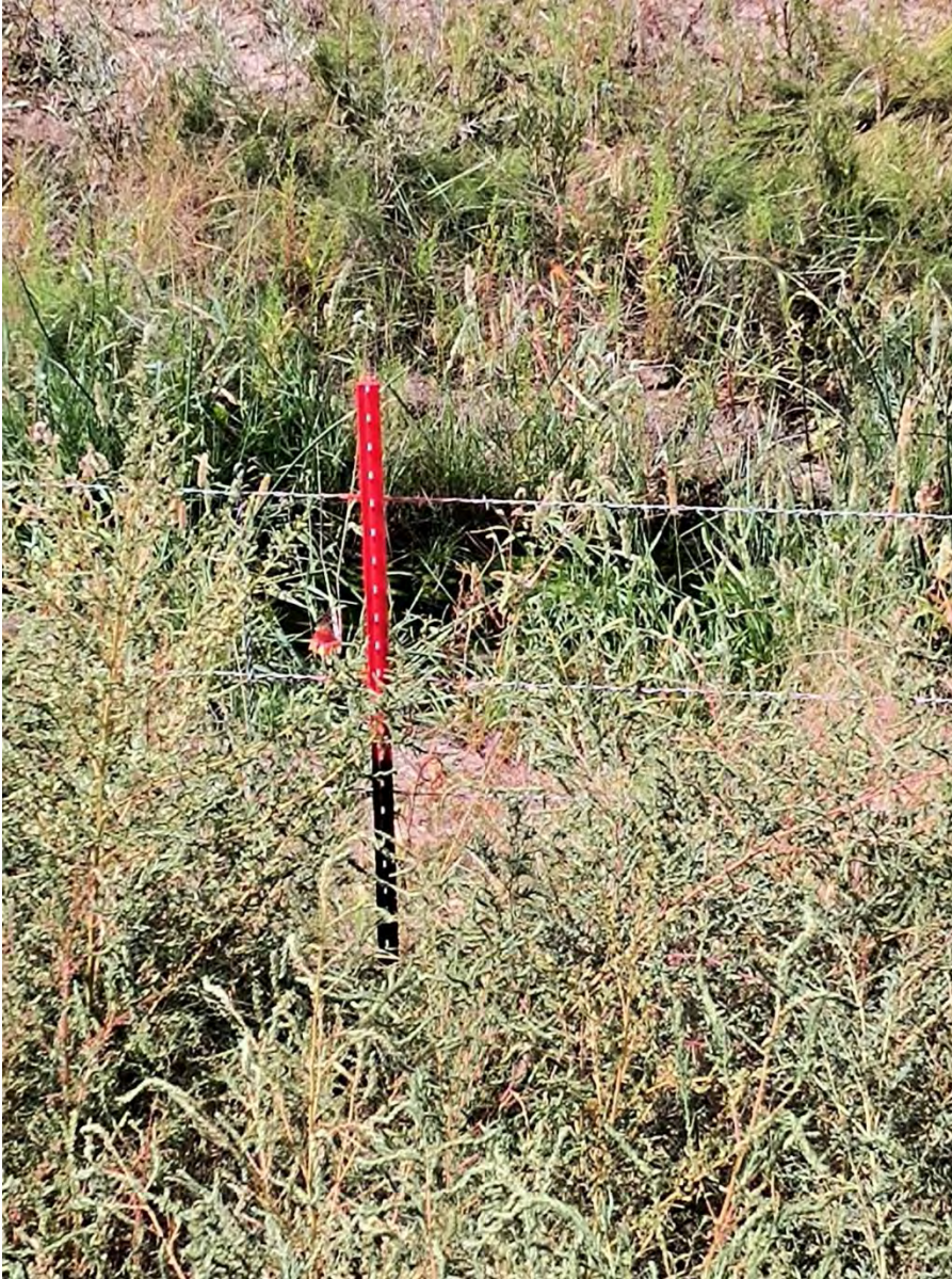
Plate 2. NW Corner at the CDOT ROW Fenceline looking from the East.