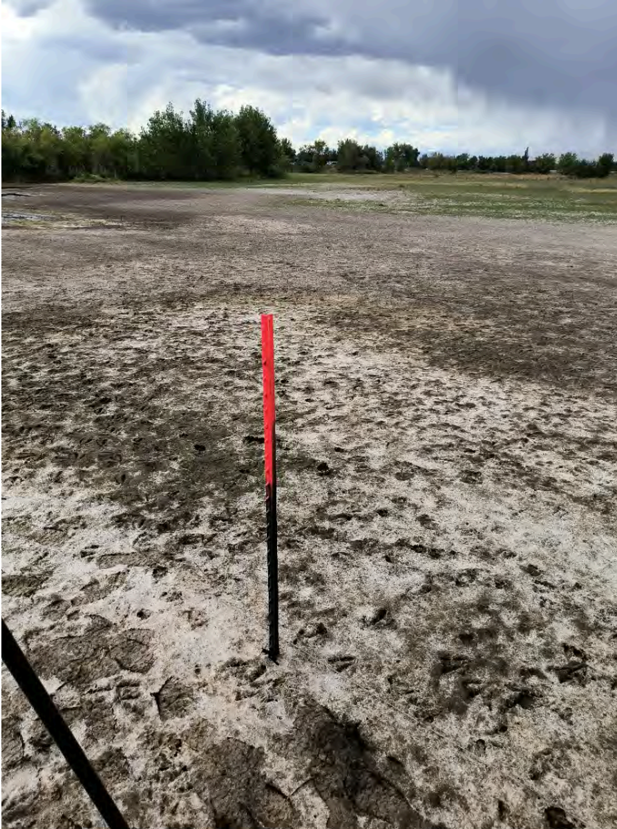
Plate 4. South Line stake where the Permit Boundary Intersects Linda O'brien's East Property Line looking from the East.