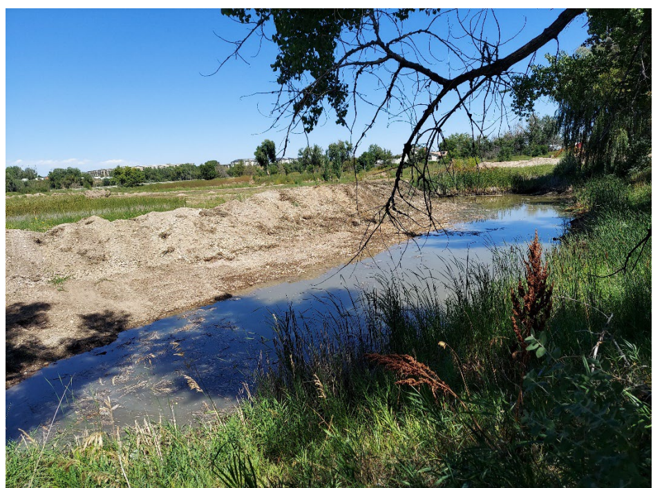
Note how wide and deep the dig is.

The digging now connects the preexisting pond directly in front of Kirtright household to the rest of the area.