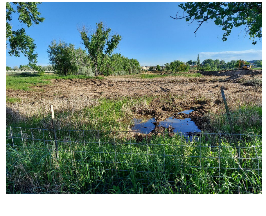
Note the newly –formed mounds of dirt.