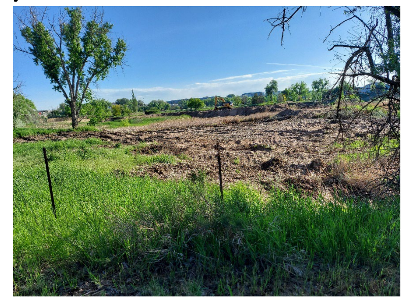
After 2.5 Weeks of Digging