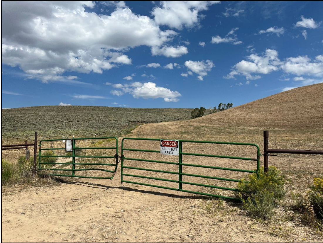
Photo 2: Entrance gate, an appropriate mine identification sign is missing.