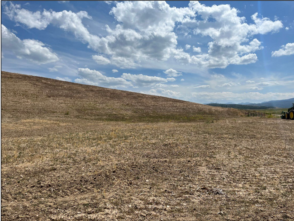
Photo 6: View east of the partially reclaimed hillside and staging area.

Tootie Crowner Jackson County P.O. Box 488 Walden, CO 80480