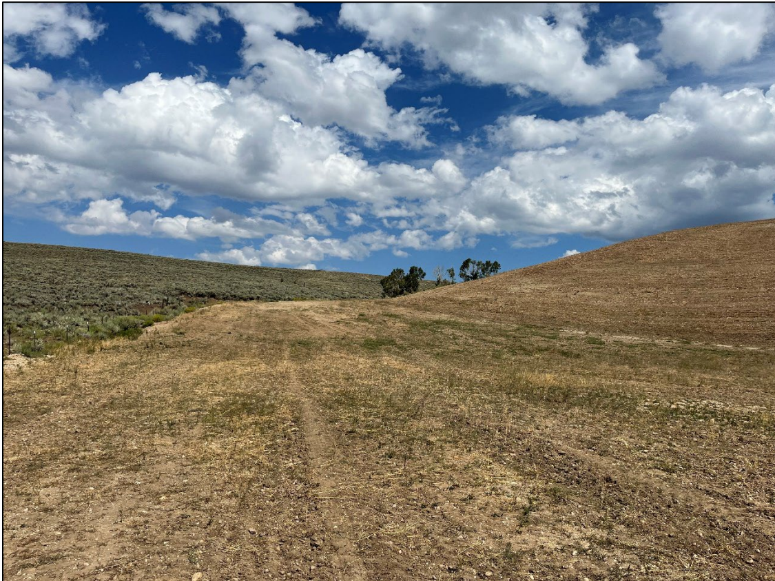
Photo 5: View north of the eastern permit boundary, partially reclaimed.