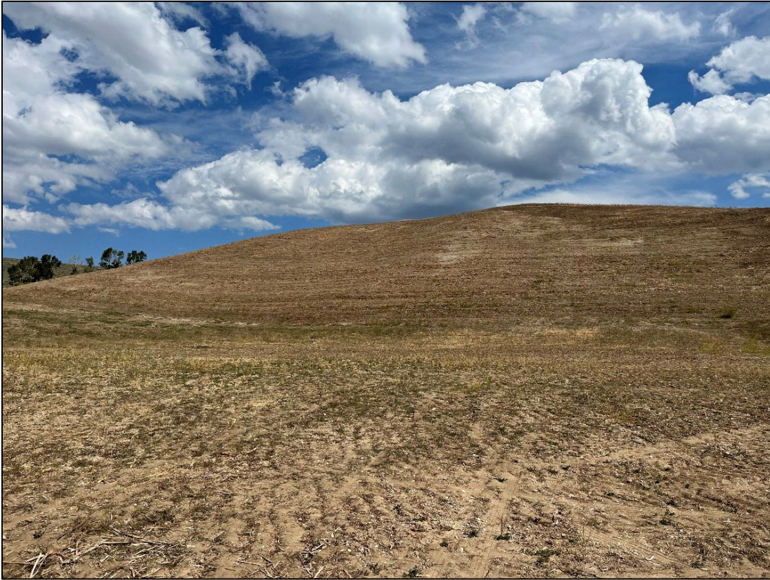
Photo 4: View north of the reclaimed highwall and staging area. The previously mined highwall extended about halfway up the hillside.