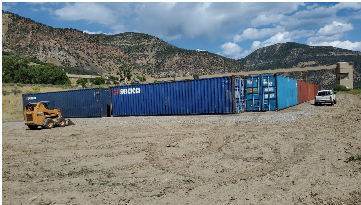
Figure 4: Shipping containers placed

Number of Partial Inspection this Fiscal Year: 2