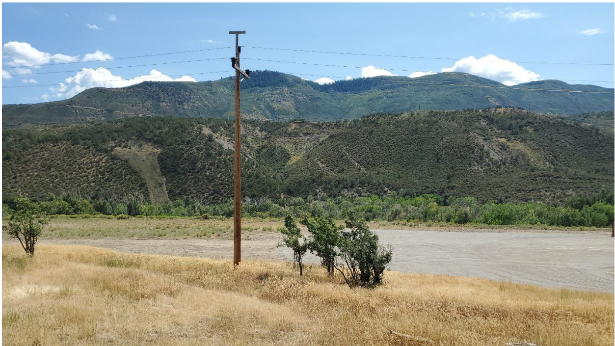
Figure 2: Overview of lower pad (east)

Number of Partial Inspection this Fiscal Year: 2