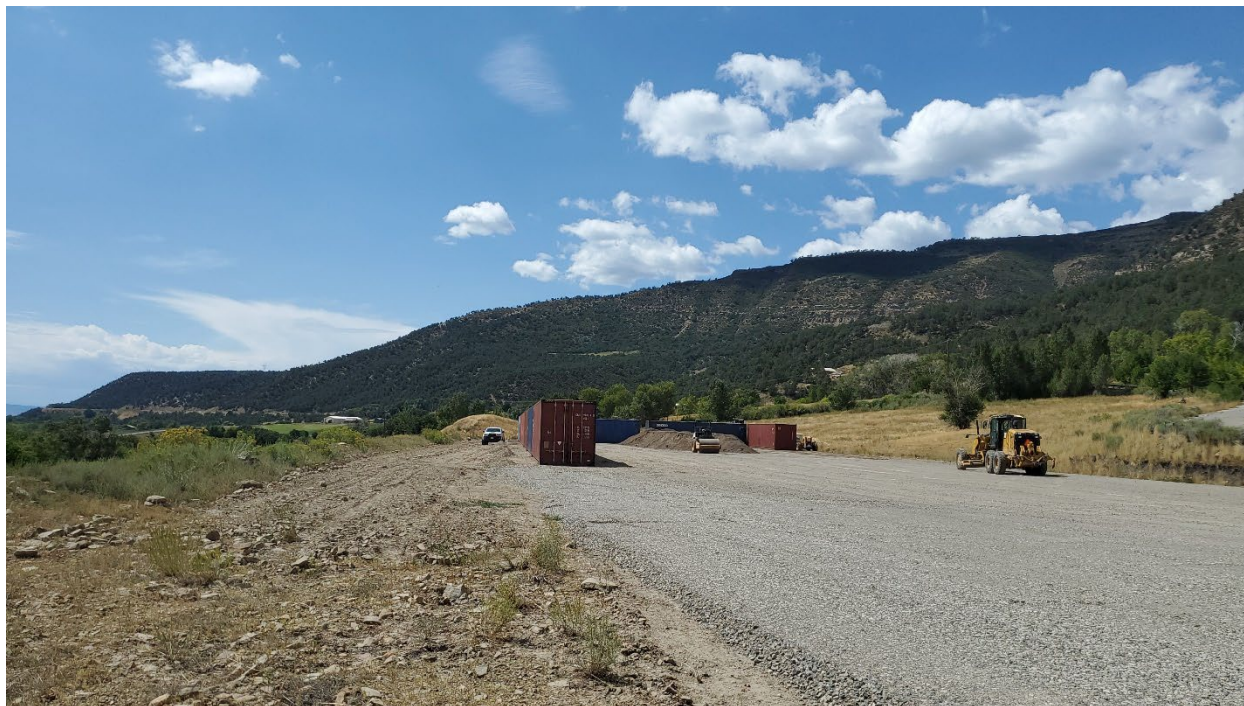
Figure 3: Pad has been leveled, compacted and graveled