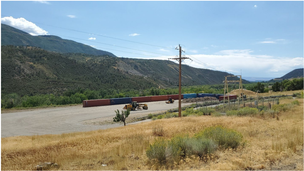
Figure 1: Overview of lower pad (west)