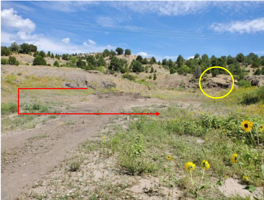
Photo 1: Looking north-east at the mining disturbance on-site. Circle indicates a small area where the slope on-site is steeper than 3H:1V. Arrow indicates the flow of water on-site.