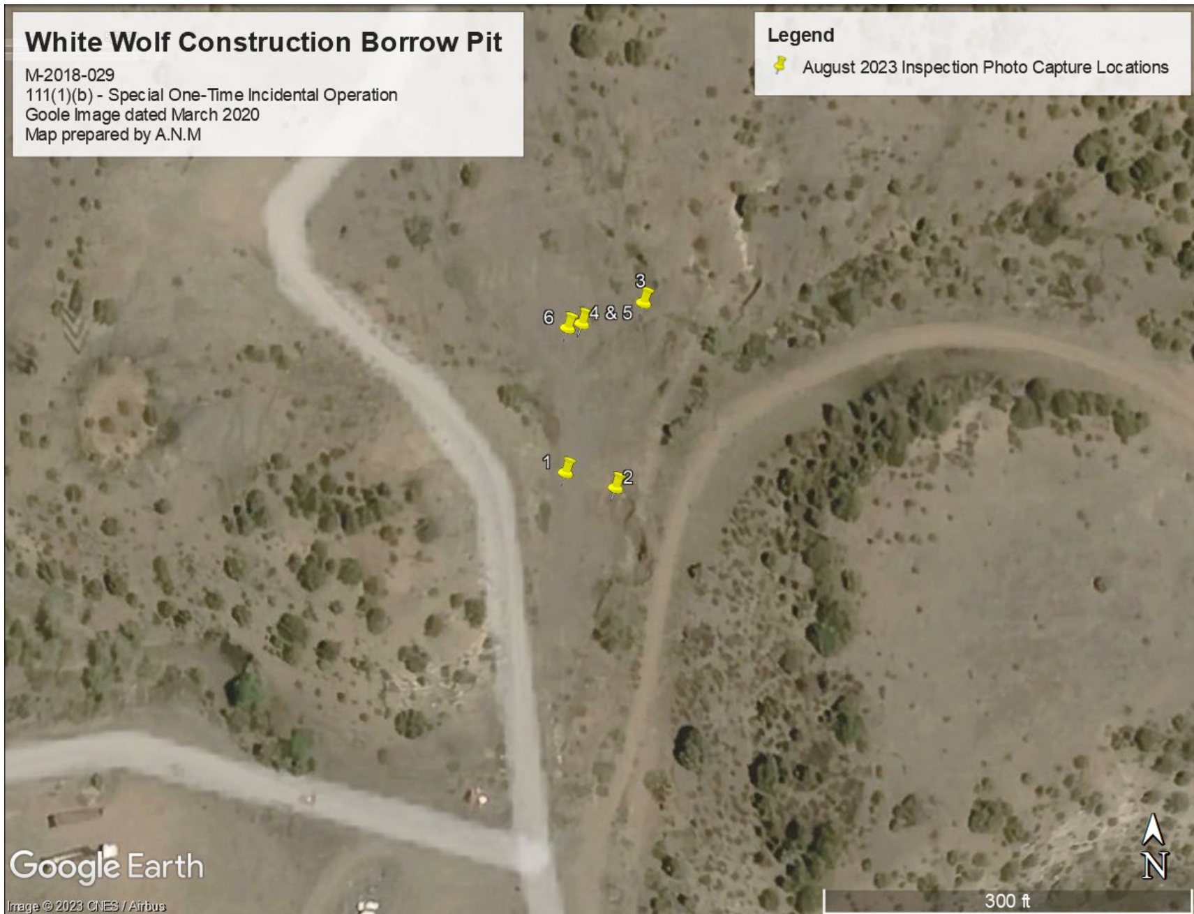
Map 1: Map prepared in Google Earth Pro showing the photo capture locations during the Division’s August, 23, 2023 routine monitoring inspection of the White Wolf Construction Borrow Pit.