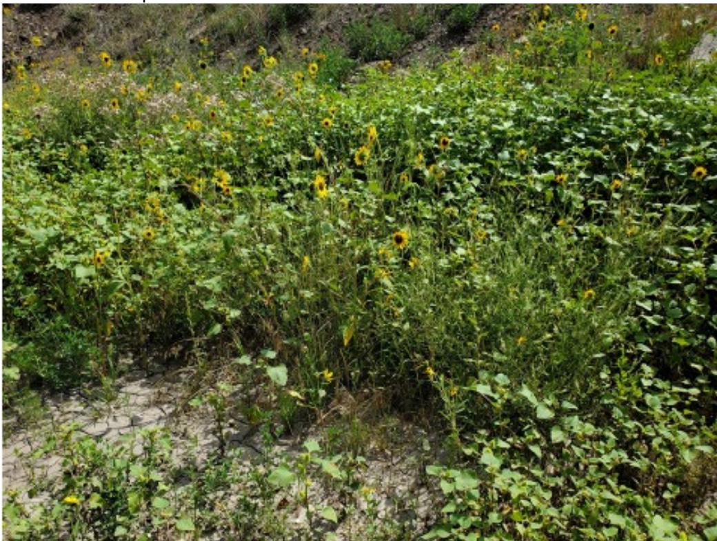
Photo 2: Looking east at the south end of the site where water and sediment are captured in a shallow heavily vegetated basin.