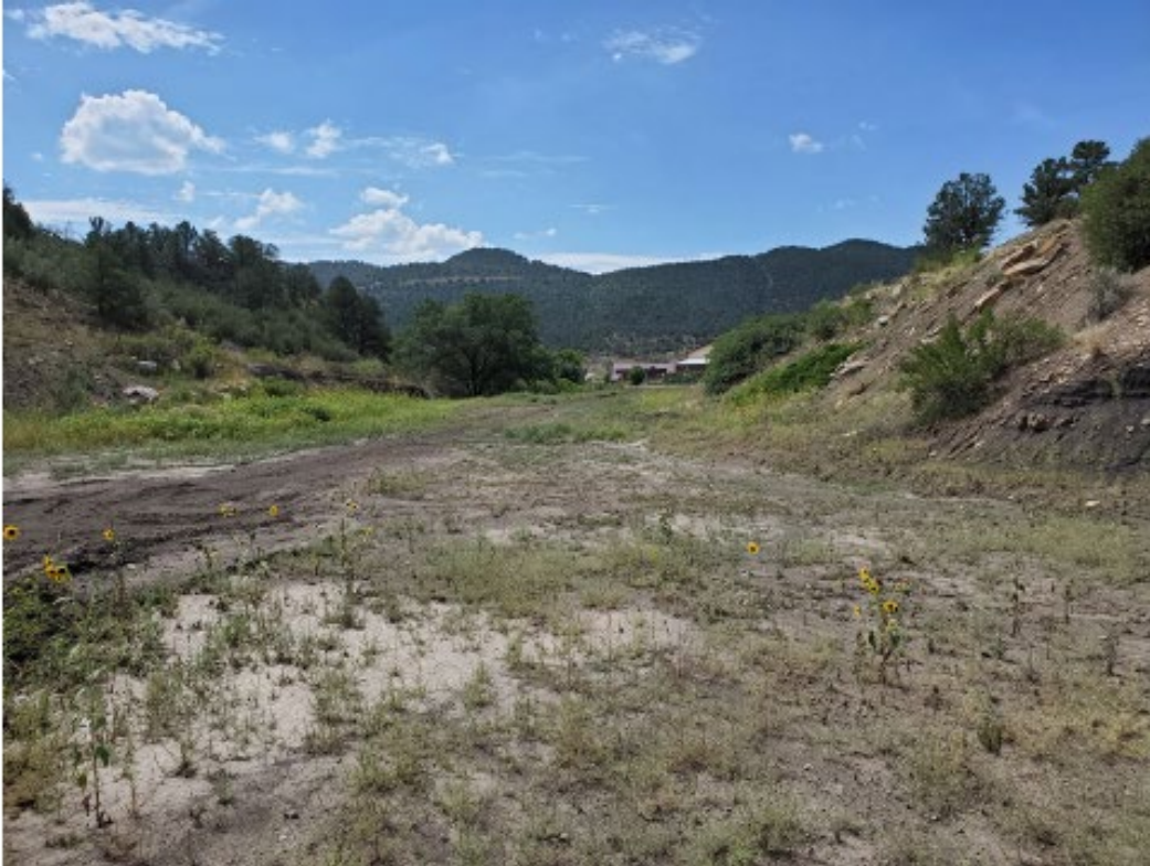
Photo 5: Looking south from the southern portion of the site towards the Operator's home and Highway 12.