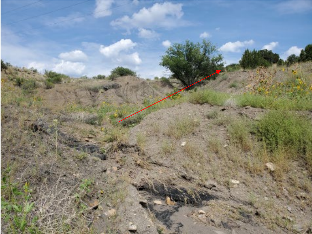
Photo 6: Looking north-west at another drainage that bisects and separates the middle of the site from the western portion.