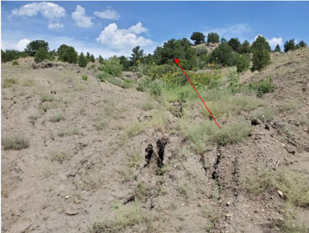
Photo 3: Looking north along a drainage beginning north of the disturbance that bisects the middle of the site from the eastern portion.