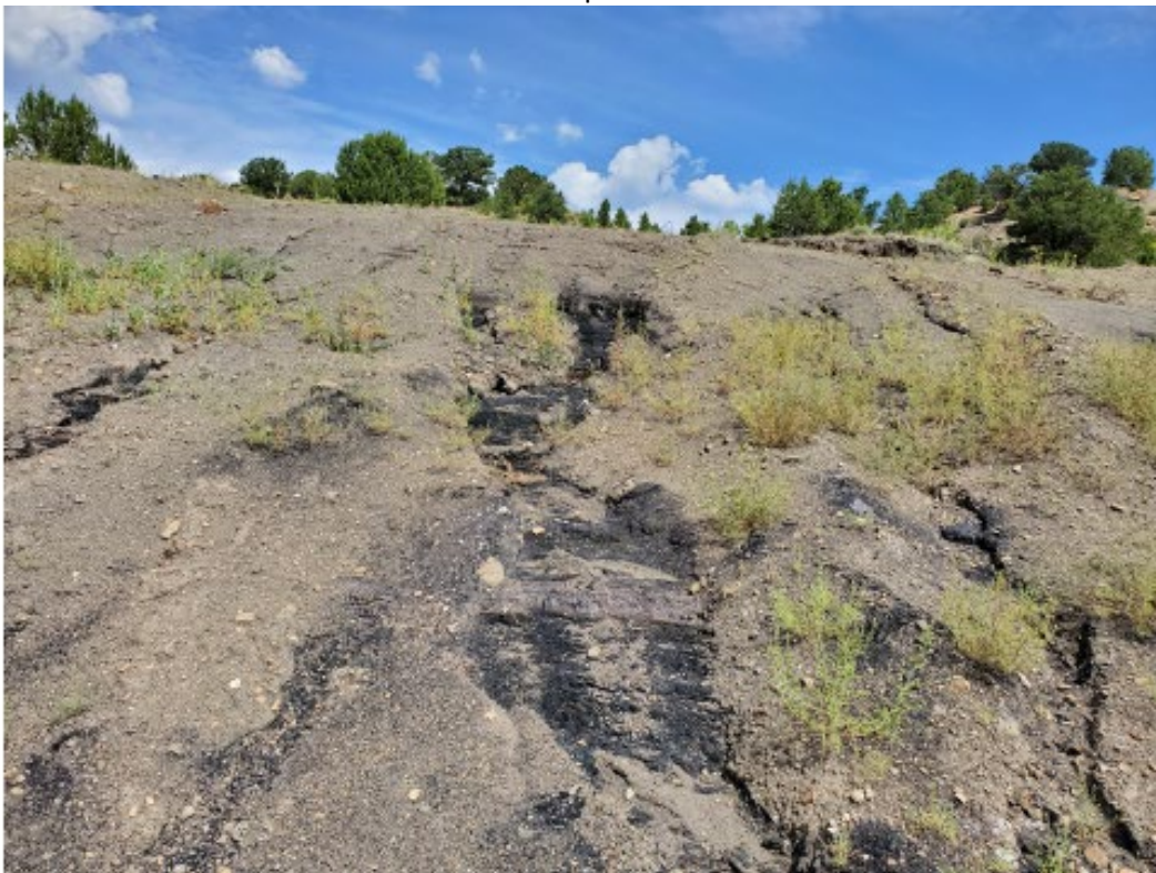
Photo 4: Looking north up the middle of the graded disturbance at minor riling. No topsoil is salvaged onsite. Very little to no topsoil is available on the adjacent undisturbed areas as well.