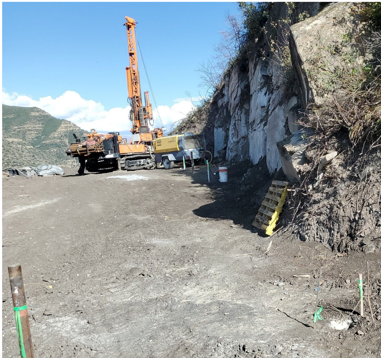
Figure 2: Drill rig on site

Number of Partial Inspection this Fiscal Year: 0