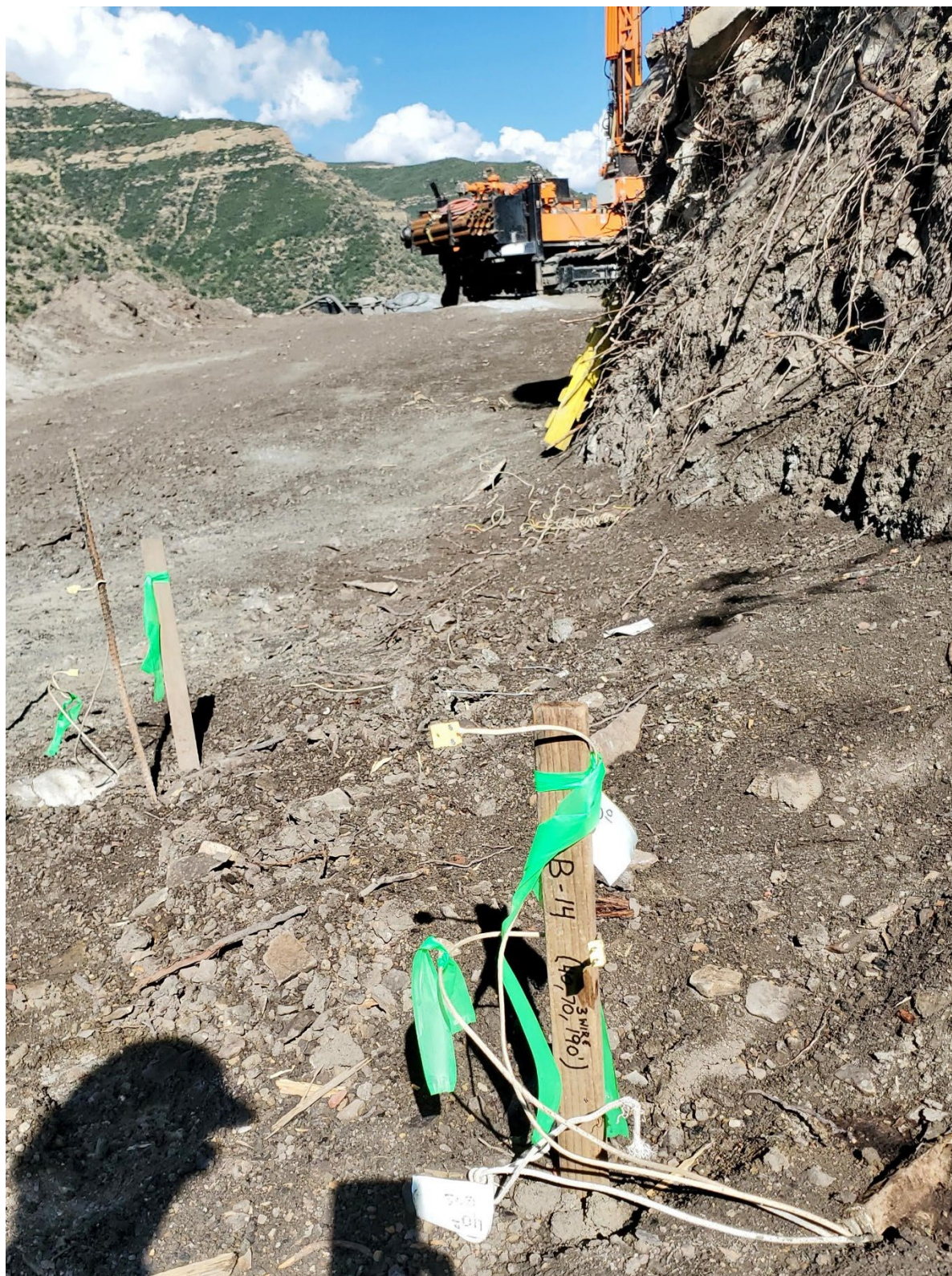
Figure 3: Thermocouples grouted into new holes

Number of Partial Inspection this Fiscal Year: 0