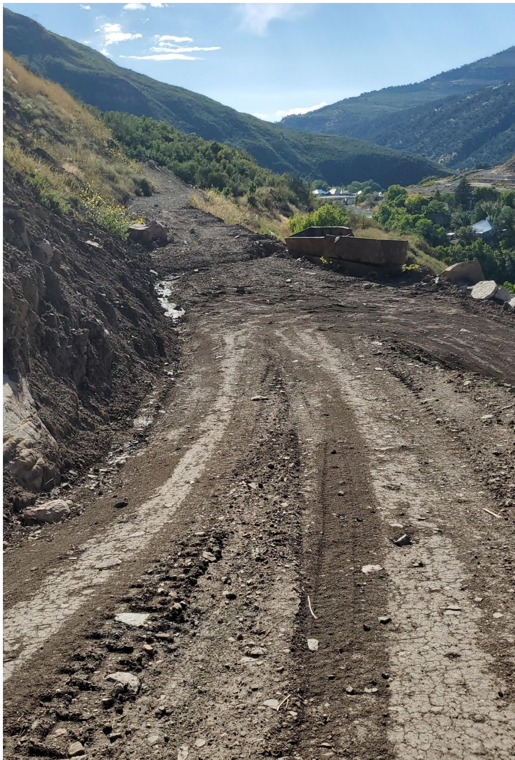
Figure 4: Surface water diversion at first hairpin on temporary road

Number of Partial Inspection this Fiscal Year: 0