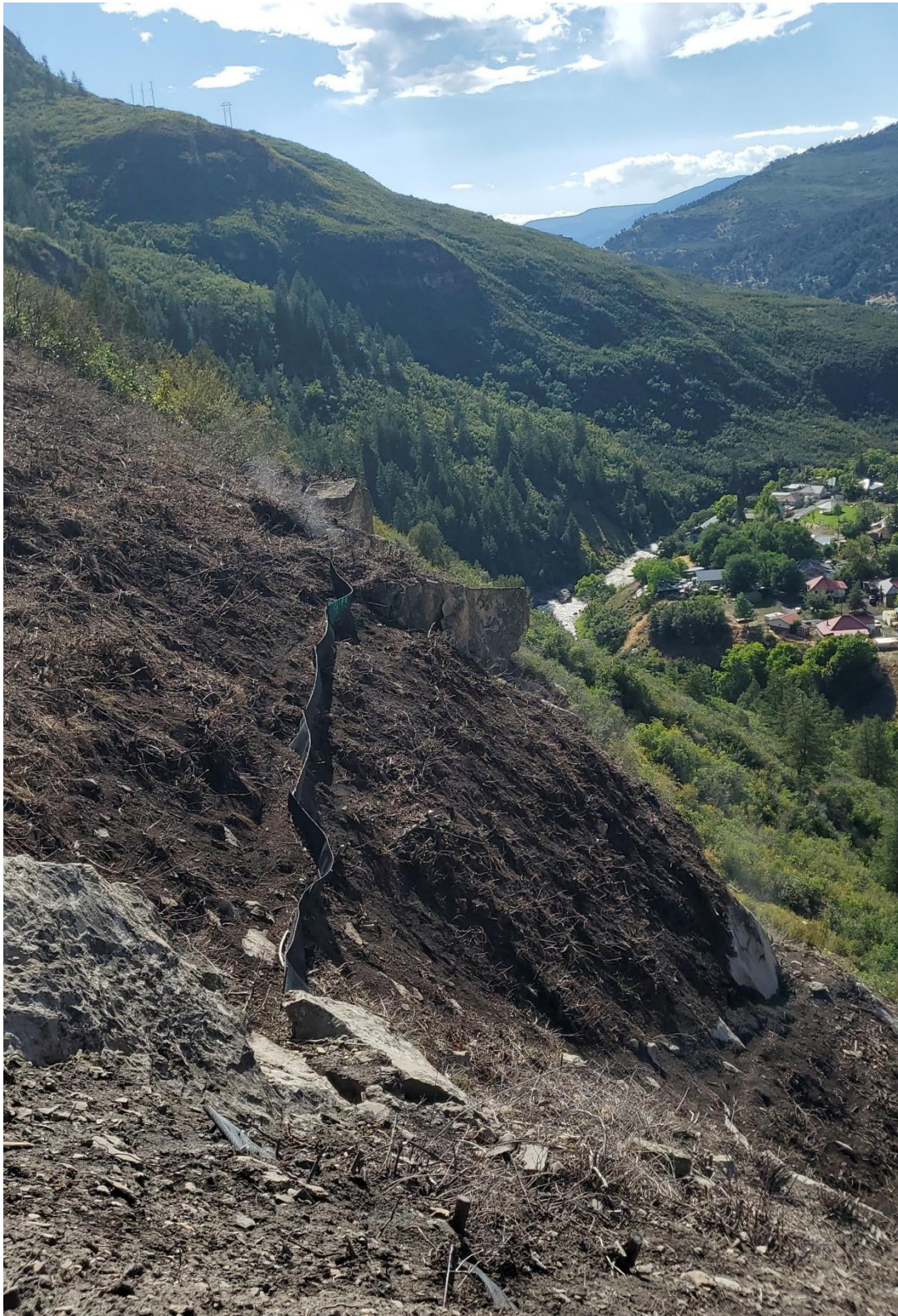
Figure 1: Smoke/steam venting from western end of bench

Number of Partial Inspection this Fiscal Year: 0