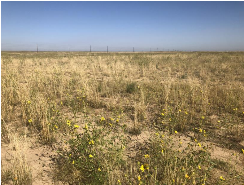
Area 44 – better grass growth than many of the other newly reclaimed areas

Number of Partial Inspection this Fiscal Year: 1