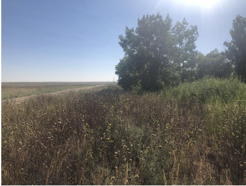
Area below Sediment Pond 2