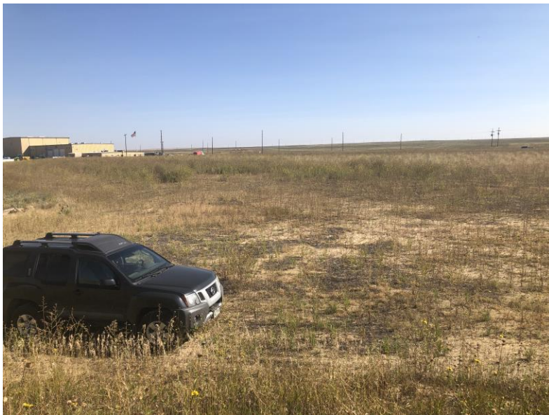
Area 38 – poor grass growth

Number of Partial Inspection this Fiscal Year: 1