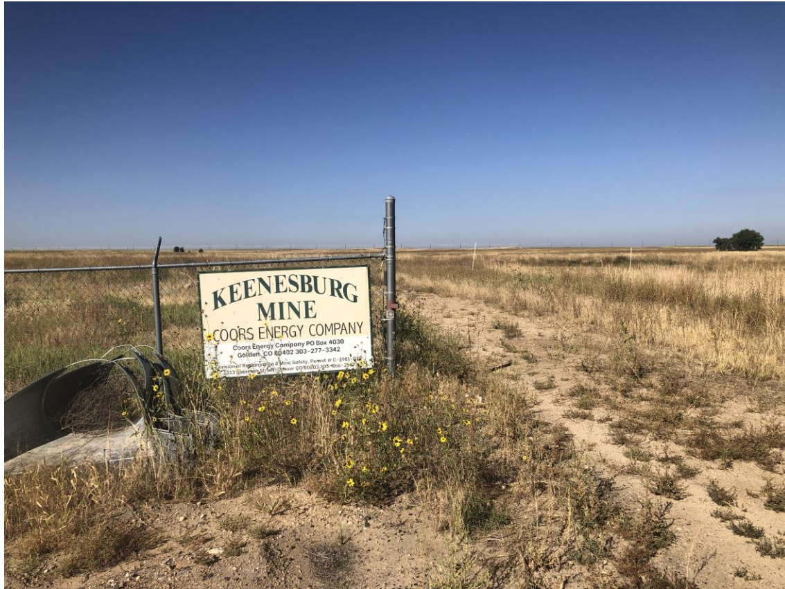
Entrance sign (recently installed at this location)

No enforcement actions were initiated as a result of this inspection, nor are any pending.