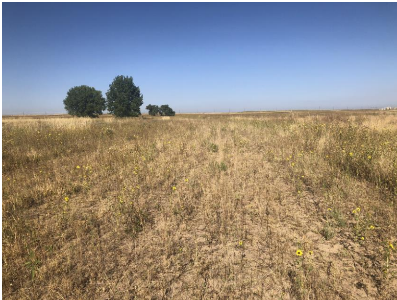
Reclaimed road near Sediment Pond 2

Number of Partial Inspection this Fiscal Year: 1