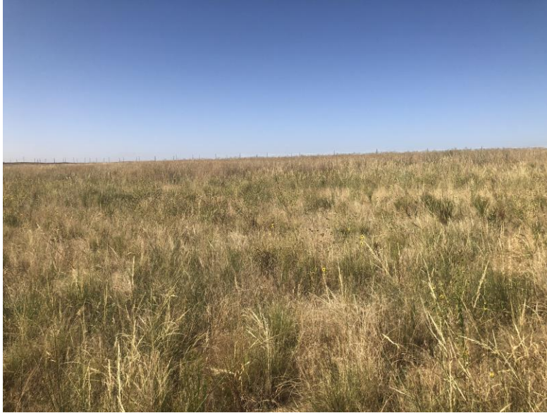
Area 31 – excellent grass growth