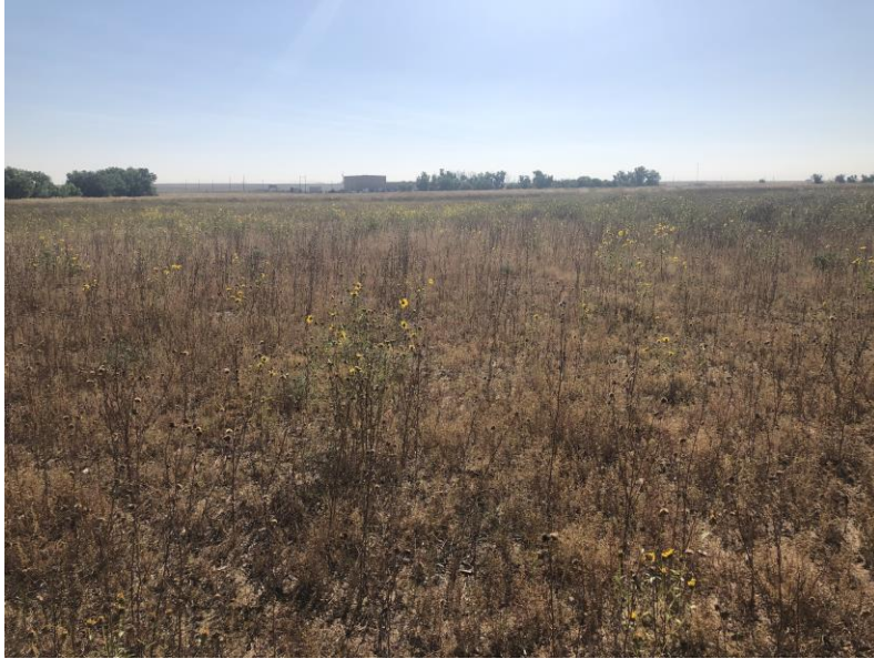
Area 37 – poor grass growth