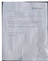
Screenshot 2023-09-05 at 8.22.52 AM.png 2863K