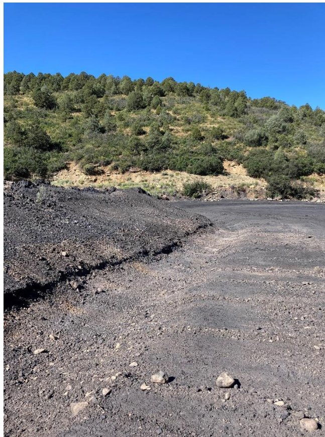
Figure 4: Item #3 Reach 10 taken from the outlet side of the culvert