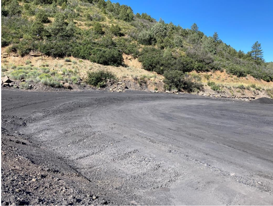
Figure 3: Item #3 Reach 10 restored to the designed location