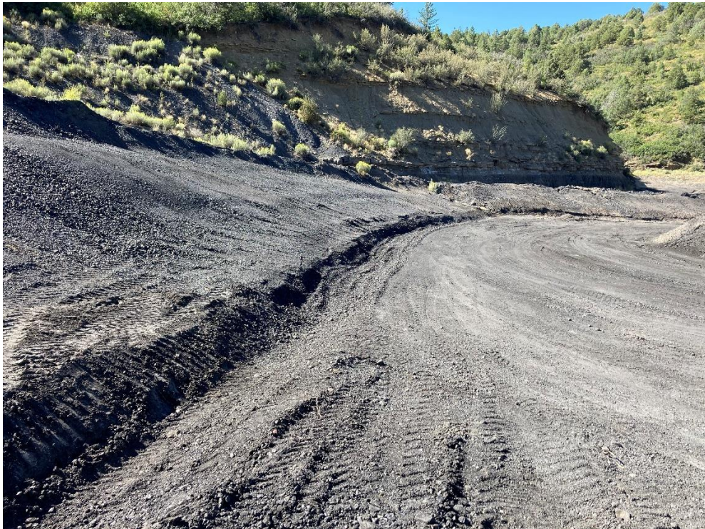
Figure 2: Item #2 Reach 13 moved to tie into Reach 10