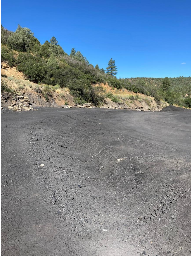
Figure 5: Item #3 Reach 10 restored to the designed location