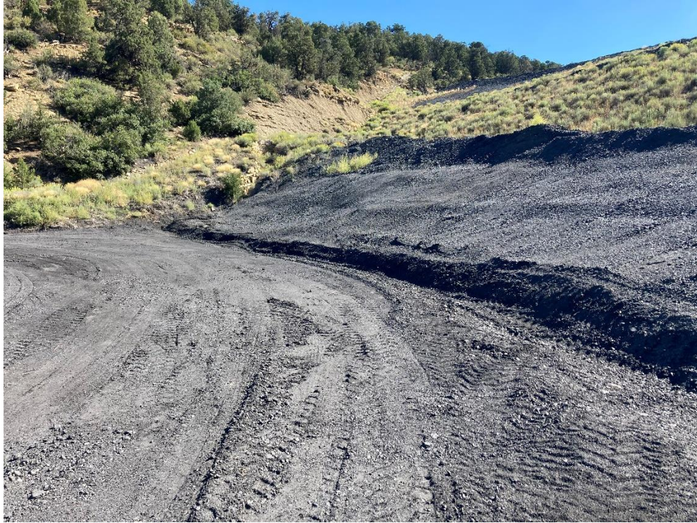
Figure 1: Item #2 Reach 13 moved to tie into Reach 10