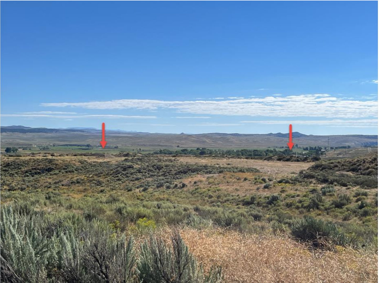
Material stockpiles at Middle Pit.