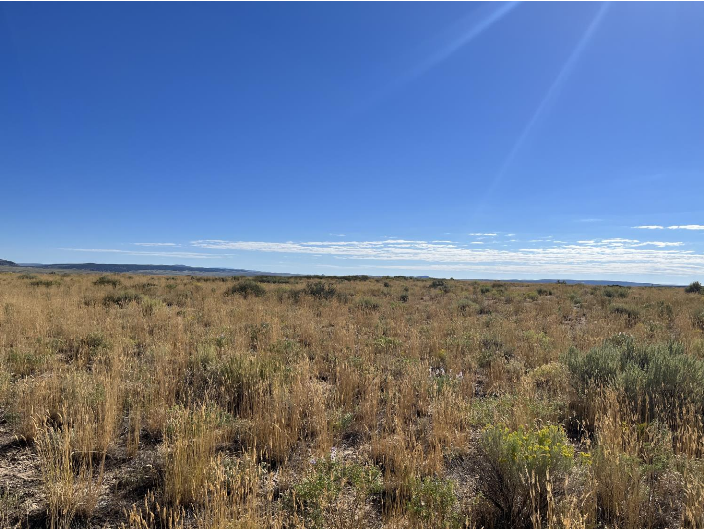
West Pit reclamation.