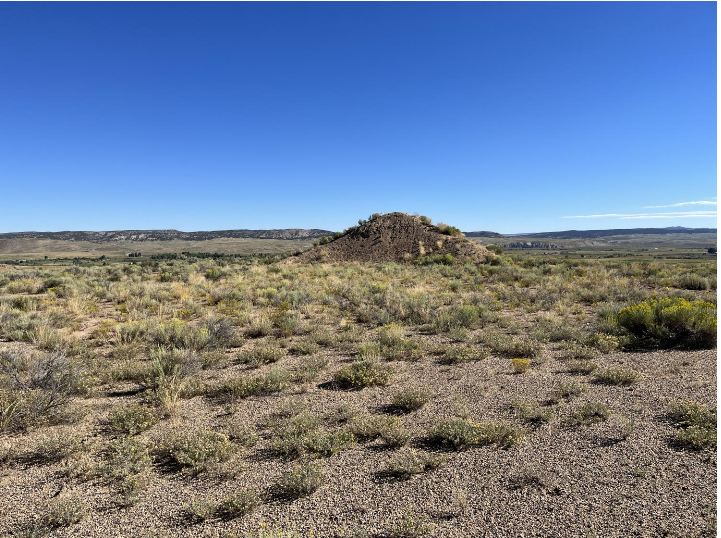
Material stockpile at Middle Pit.