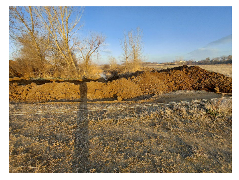
Shows the dirt taken on Kirtright property to dig westward.