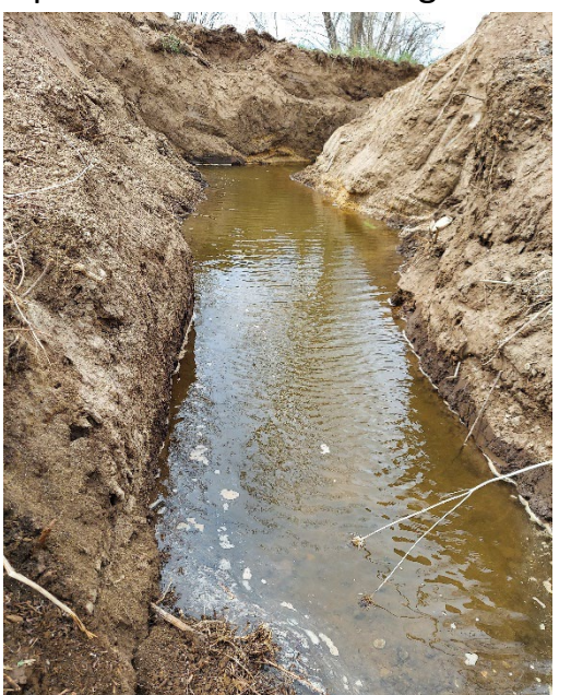
This picture was taken within a few days of when the ditch was dug, showing the water filled in quickly.