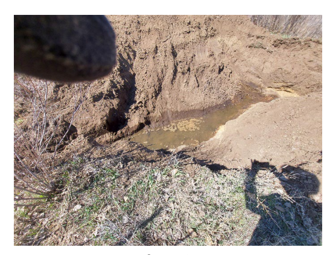
8 to 10 feet deep