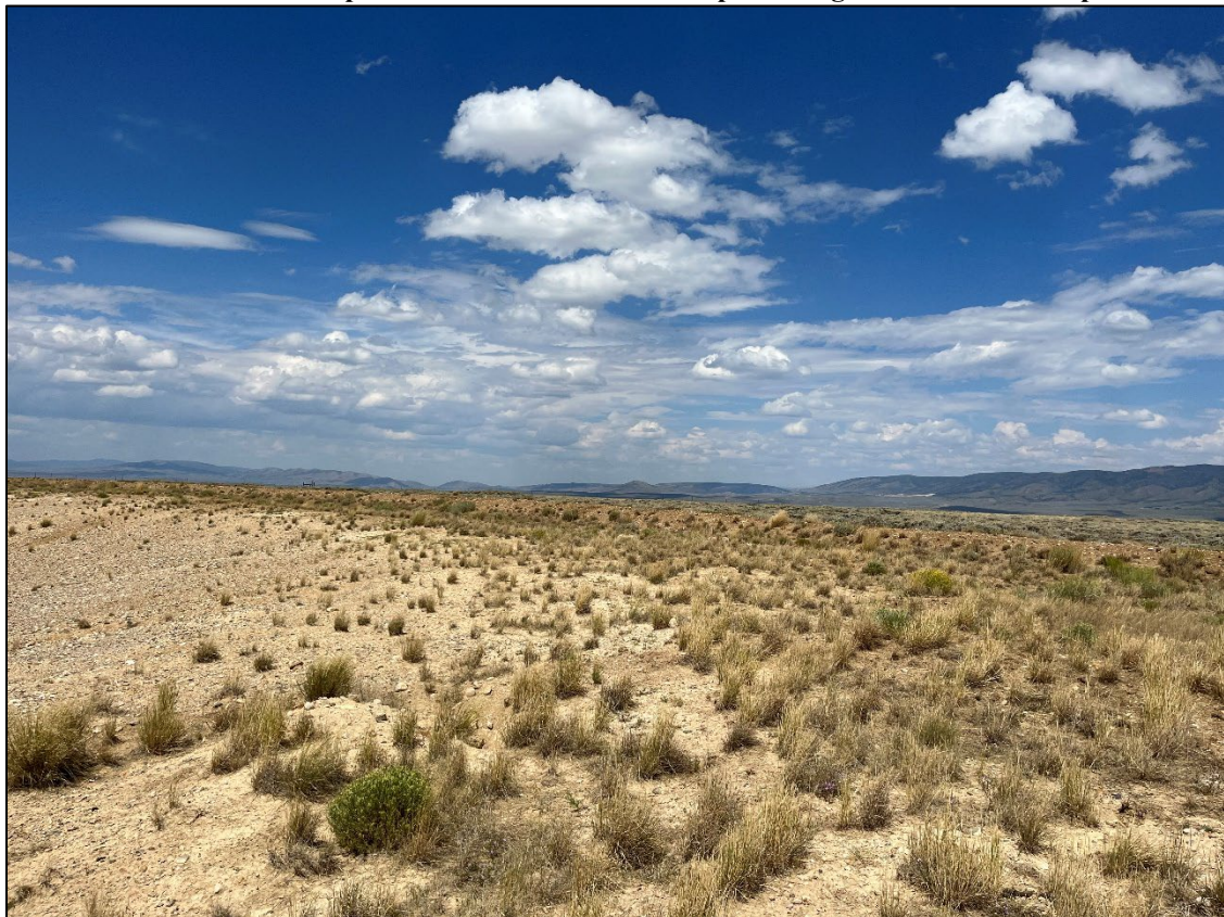
Photo 11: View north of additional land included in the permit boundary which is not yet stripped or mined.