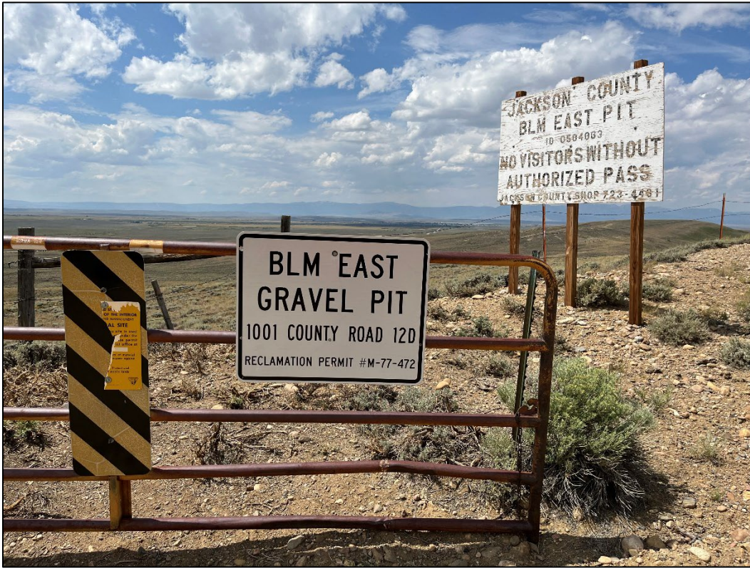
Photo : A mine identification sign is located at the pit entrance.