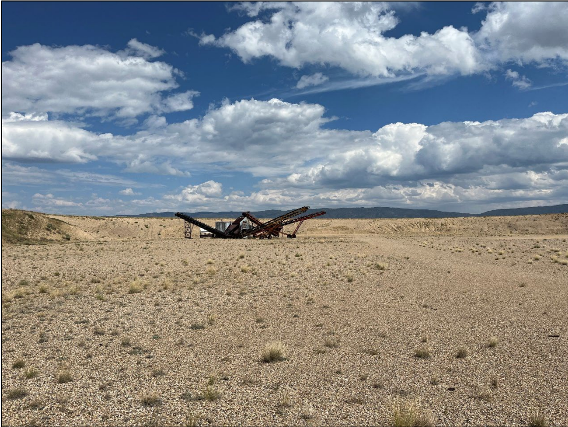
Photo 6: View north of pit floor, unused processing equipment, and highwall.