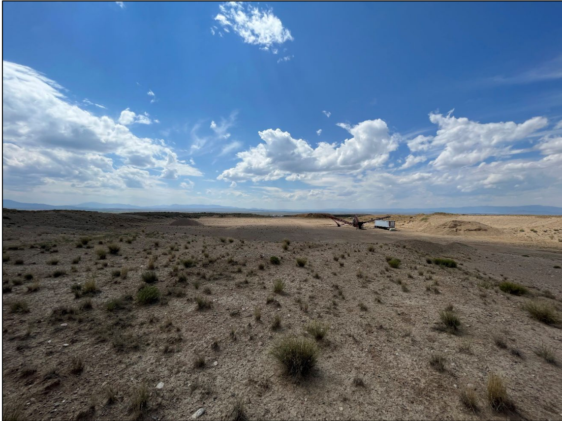
Photo 12: View southwest of the pit floor from atop the northern most mined slope.

Tootie Crowner Jackson County P.O. Box 488 Walden, CO 80480