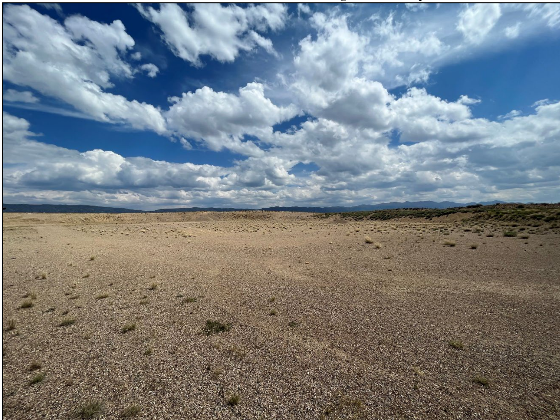
Photo 5: View northeast of open pit floor, eastern highwall, and small stockpiles of material.