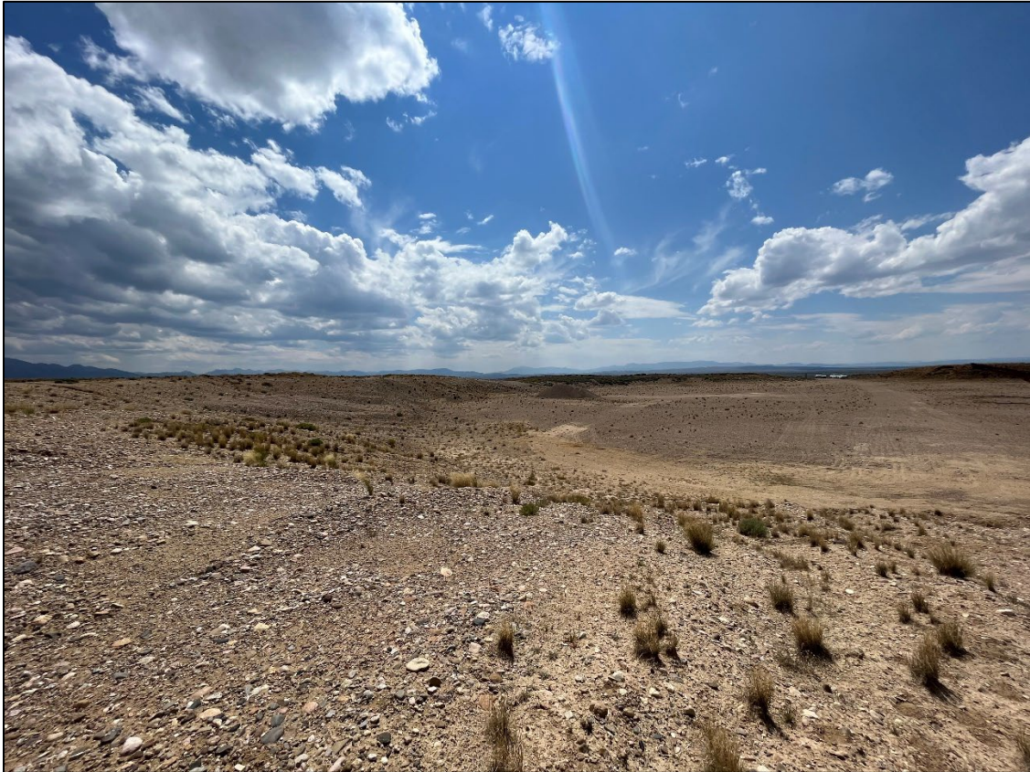
Photo 10: View from atop the northern most mined slope looking south towards the pit floor.