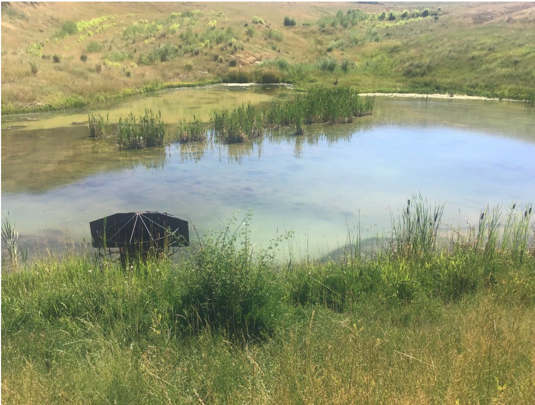
Photo 1: Pond 12, looking (east) up the slopes awaiting final bond release.