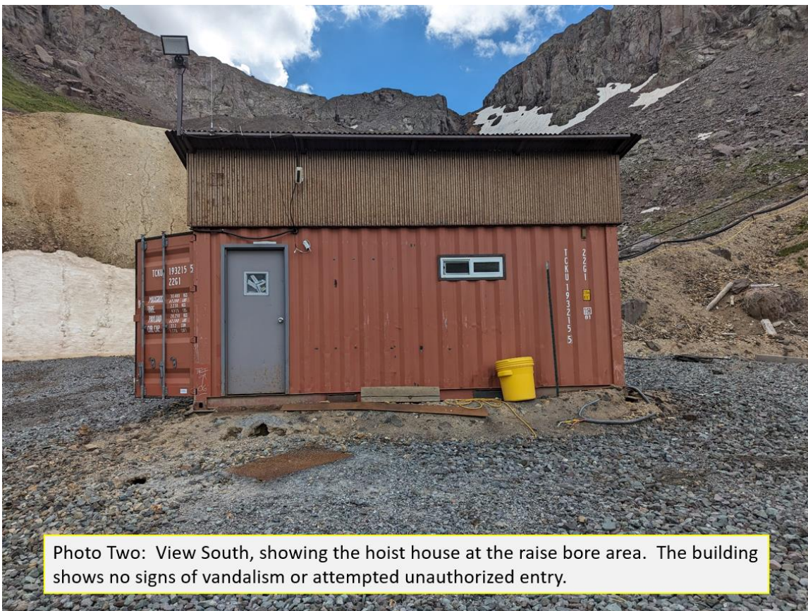
Photo Two: View South, showing the hoist house at the raise bore area. The building shows no signs of vandalism or attempted unauthorized entry.