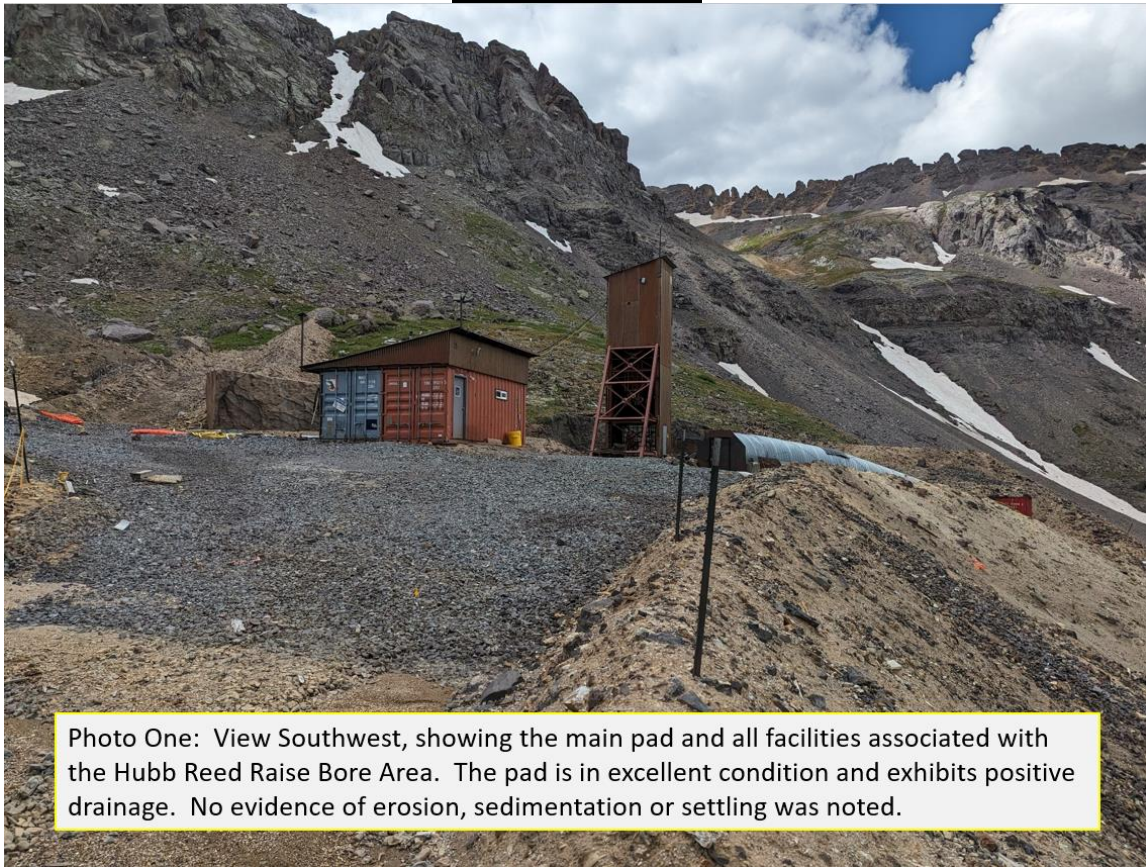
Photo One: View Southwest, showing the main pad and all facilities associated with the Hubb Reed Raise Bore Area. The pad is in excellent condition and exhibits positive drainage. No evidence of erosion, sedimentation or settling was noted.