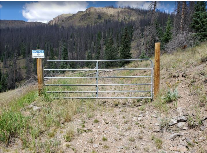
View to the west of gate that controls access to NOI