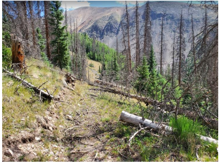
View to the northeast of access road with down trees.