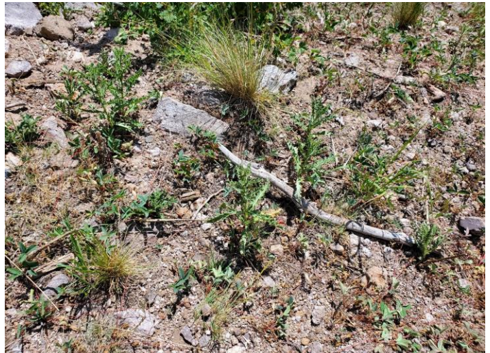
View of a small patch of Canadian Thistle