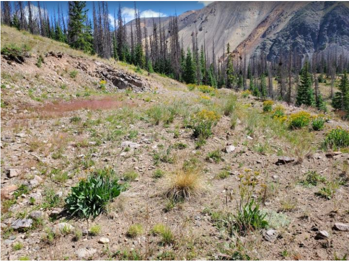
View to the north of drill pad at the North Amethyst West NOI.