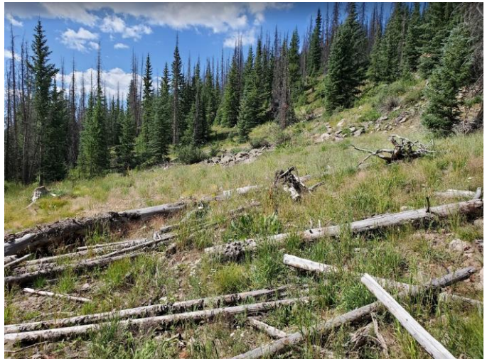
View to the south of reclaimed pad WE-2.