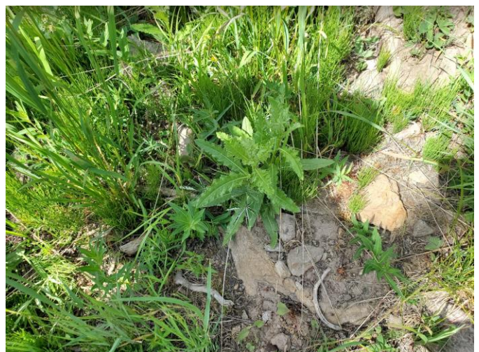
View of small infestation of Canadian Thistle.