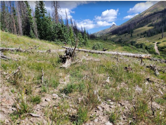
View to the north of reclaimed pad WE-1.