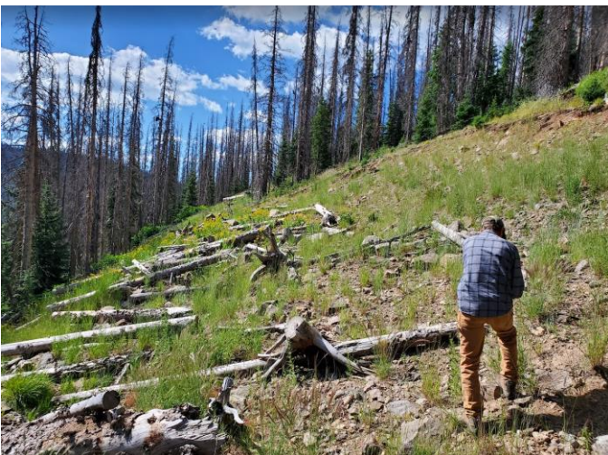
View to the south of the reclaimed road leading to WE-2.