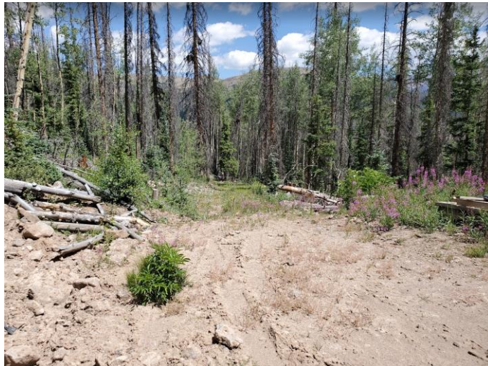
View to the northeast of empty access road to BD-8.