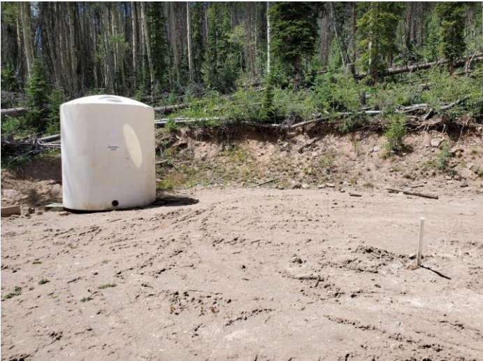
View to the southwest of empty water tank on pad BD-7