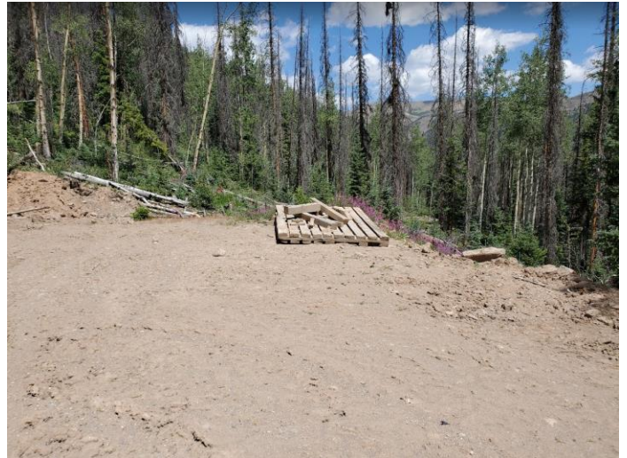
View to the north of pad BD-7 with mud mat used to prevent heavy equipment from sinking into mud.