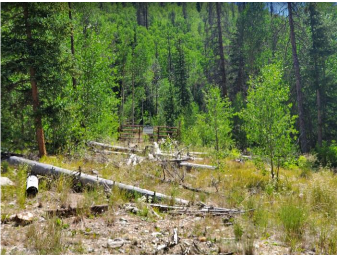
View to the east of access road to NAS-1. Slash has been placed across the reclaimed road to prevent access.