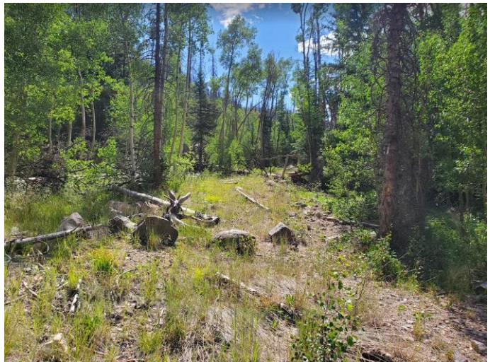
View to the southeast of access road to pad NAS-3. Large rocks are placed at the entrance to the reclaimed road to prevent vehicles from entering.