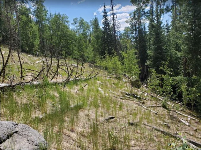
View to the southeast of pad CIS-2.