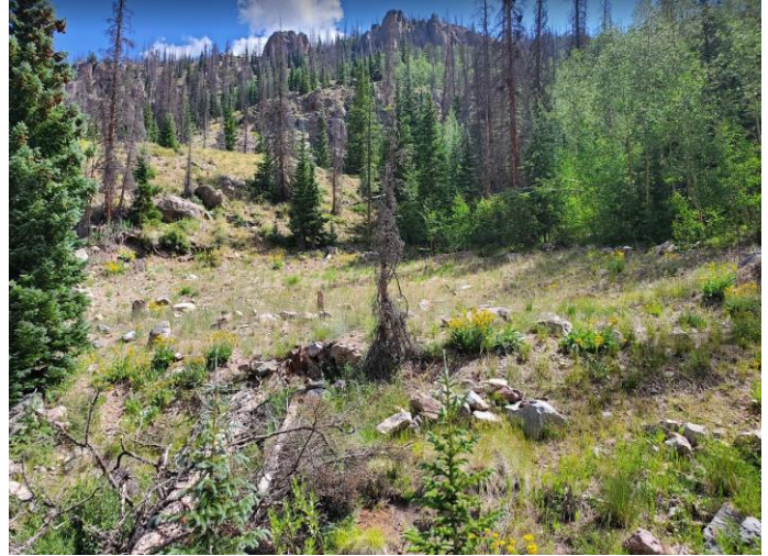
View to the northeast of pad NA-4