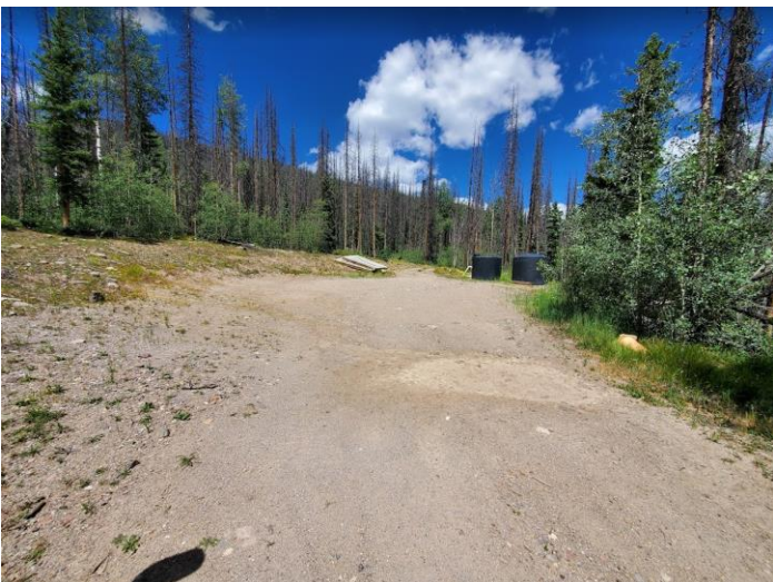
View to the north of BD-6 pad.