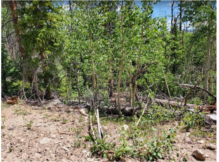
View to the east of undeveloped BD-5 pad.