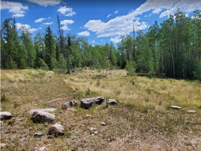
View to the east of reclaimed road going to pads BD-1 through BD-4