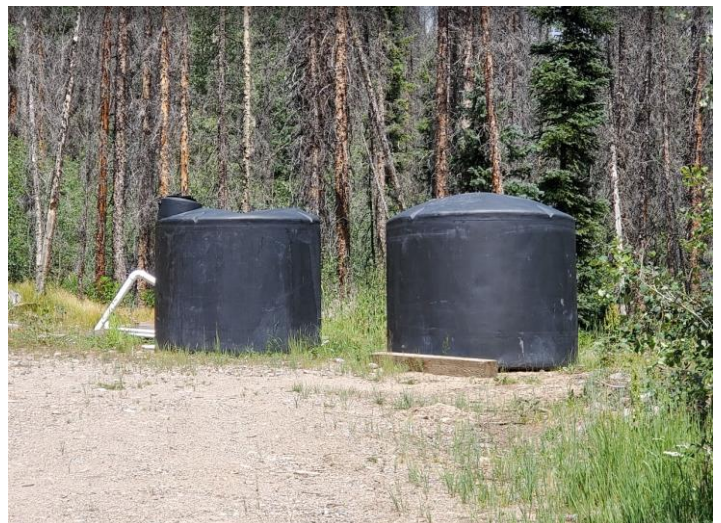
View to the north of empty water tanks on pad BD-6