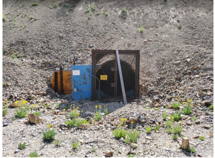
View to the east of vent adit. Gate securing adit is secure.