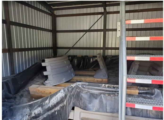
View to the east of the fuel storage building. Fuel tanks have been removed.