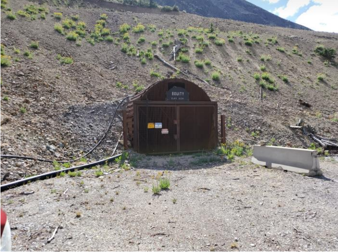
View to the east of the main portal. Gate securing portal is secure.