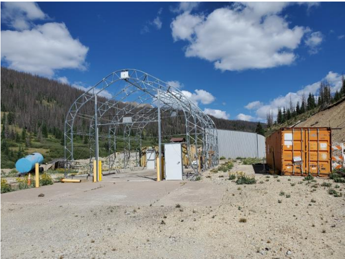
View to the north of the shop building frame.