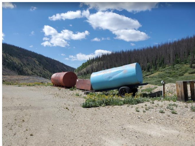
View to the south of empty water tanks in permit boundary.